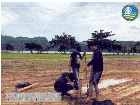
Photo showing the placing pvc pipes marker on the ground.