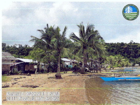
Photo showing shoreline area of Brgy. Manlag almost covered with mangrove forest.