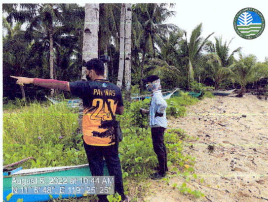
Photos showing the shoreline area of brgy. Manlag, El Nido, Pal.