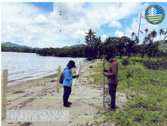
Photos showing the collection of highest tide during delineation survey.