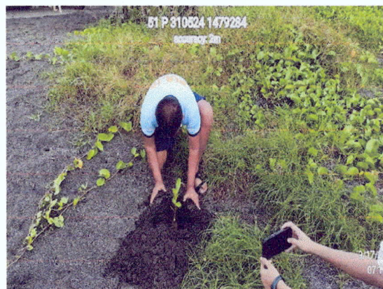
Photos showing the activities of simultaneous Coastal Clean-up and tree planting