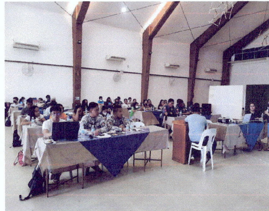
Photos showing expressing their inputs in the drafting of provincial Bantay-dagat Operational Plan held on September 22, 2022 at Parang Beach Resort