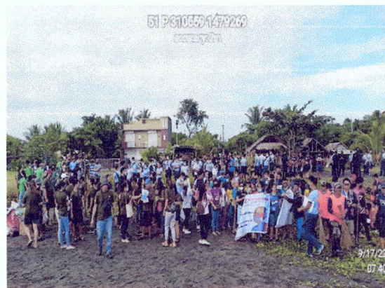
Photos showing the participants of International Coastal Clean-up 2022 in Sitio Villa Antonio, Brgy. Navotas, Calapan City