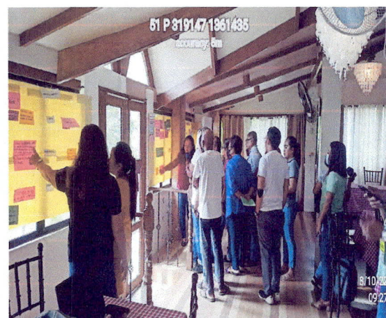
Photos showing the two (2) day technical assistance for the Integrated Coastal Management (ICM) in Bulalacao, Oriental Mindoro