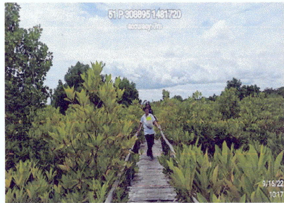
Photos showing the monitoring activities with Biodiversity Management Bureau personnel in Maidlang Eco-park at Barangay Maidlang, Calapan City