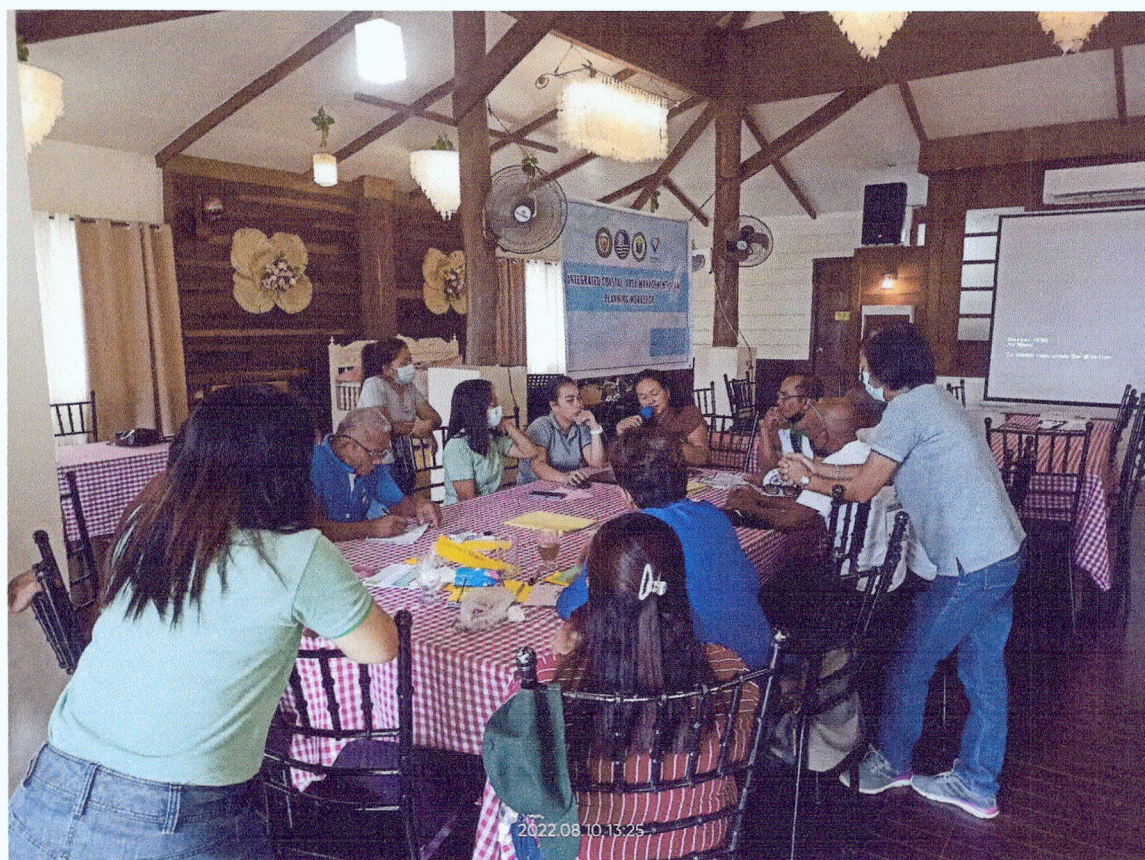
SWOT Analysis which was actively participated by the participants