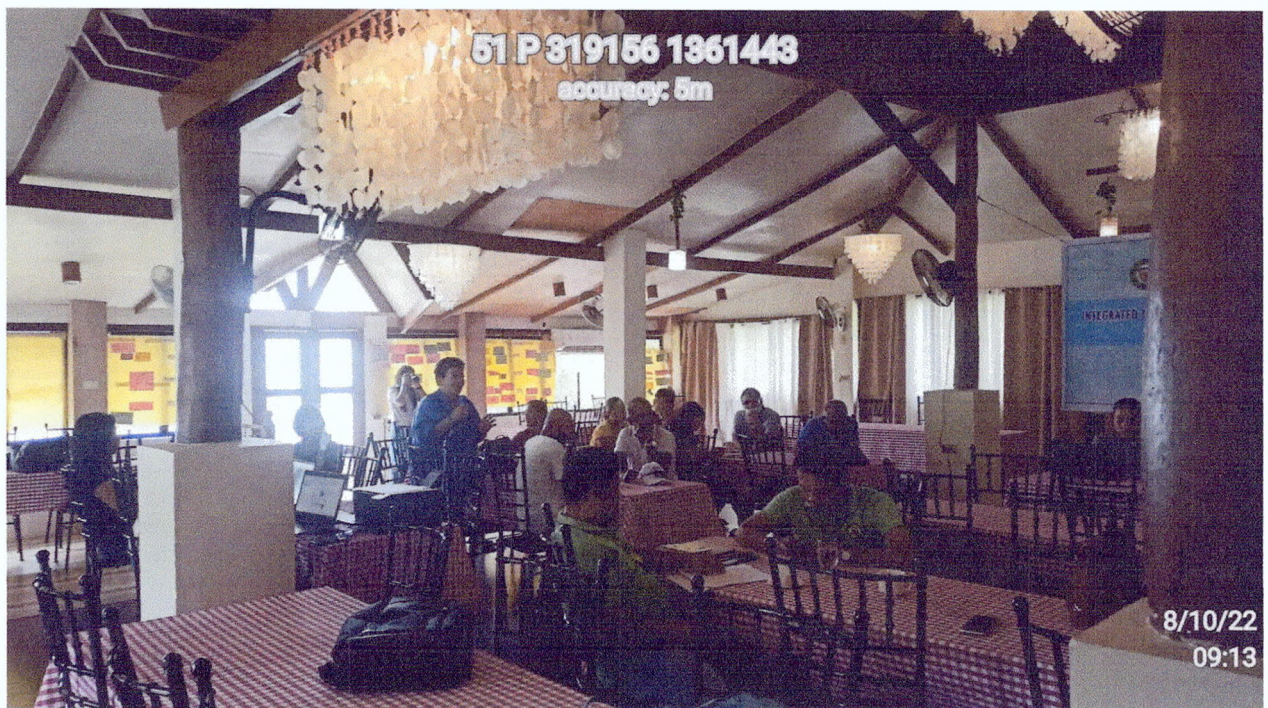
Presentation of group's outputs and Open forum