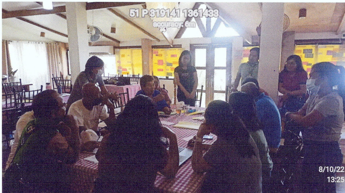
The participants of the Workshop composed of the Barangay Chairpersons of Bulalacao, Bantay Dagat and Department Heads of the MLGU.