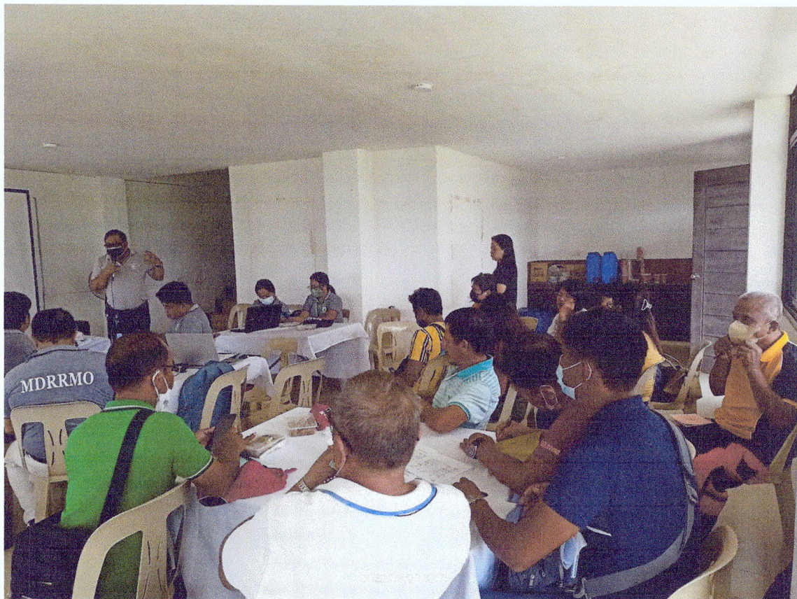
The Municipal Administrator of Bulalacao sharing their insights in the management of Coastal and Marine Resources.