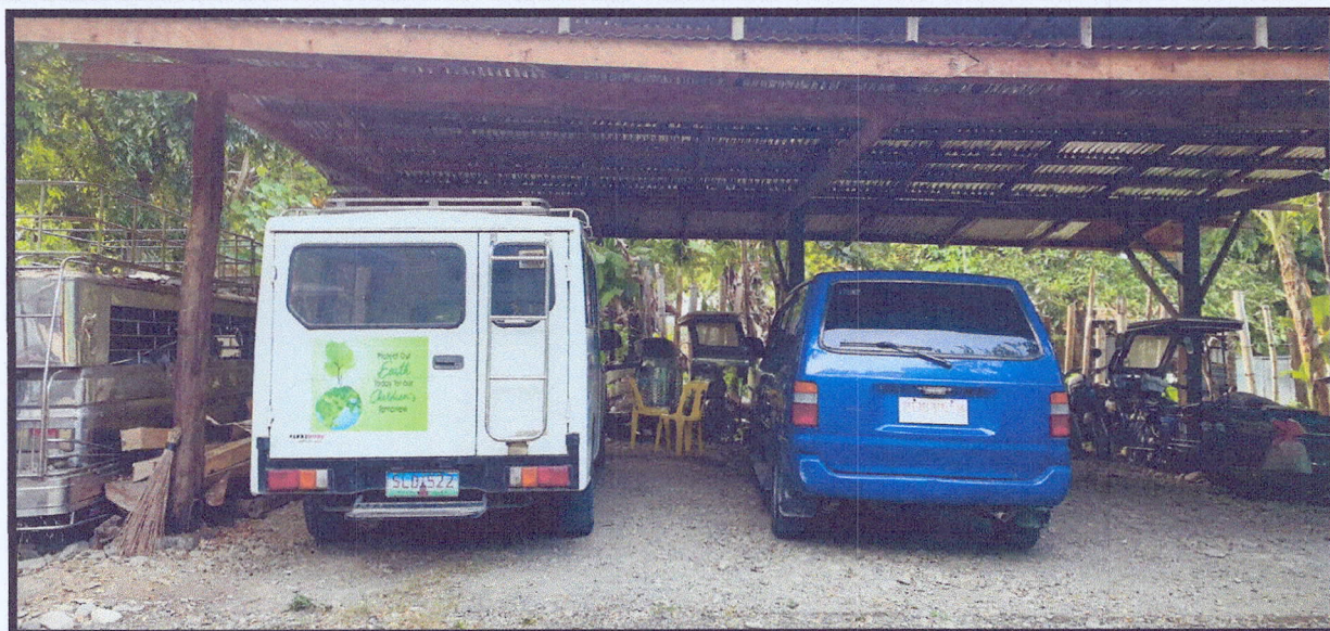
ISUZU D-MAX PASSENGER VAN (SLD-522) and Toyota Revo (21676) still maintained and serviceable.