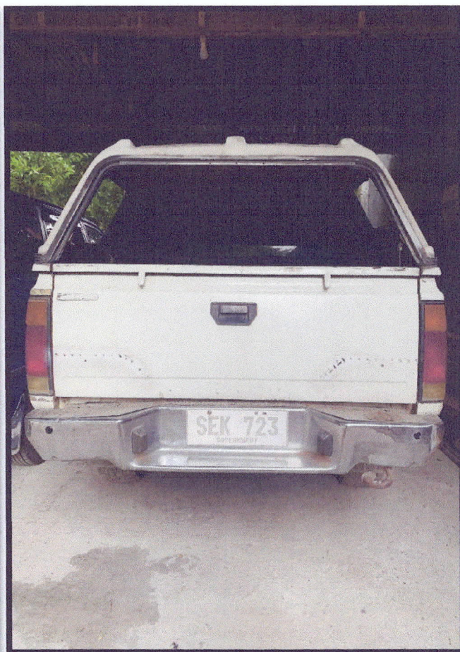
Nissan Eagle Pathfinder with plate number SEK-723 still maintained and serviceable.