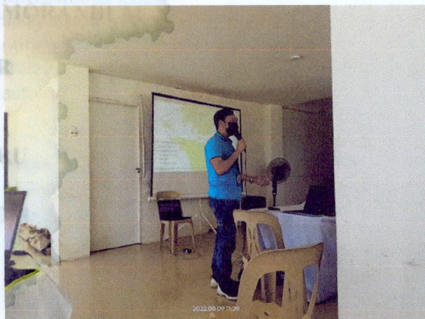
PHOTO DOCUMENTATION DURING THE CONDUCT OF INTERNATIONAL COASTAL AREA MANAGEMENT (ICAM) PLANNING WORKSHOP ON AUGUST 9-10 2022

Republic of the Philippines Department of Environment and Natural Resources MIMAROPA Region Provincial Environment and Natural Resources Office