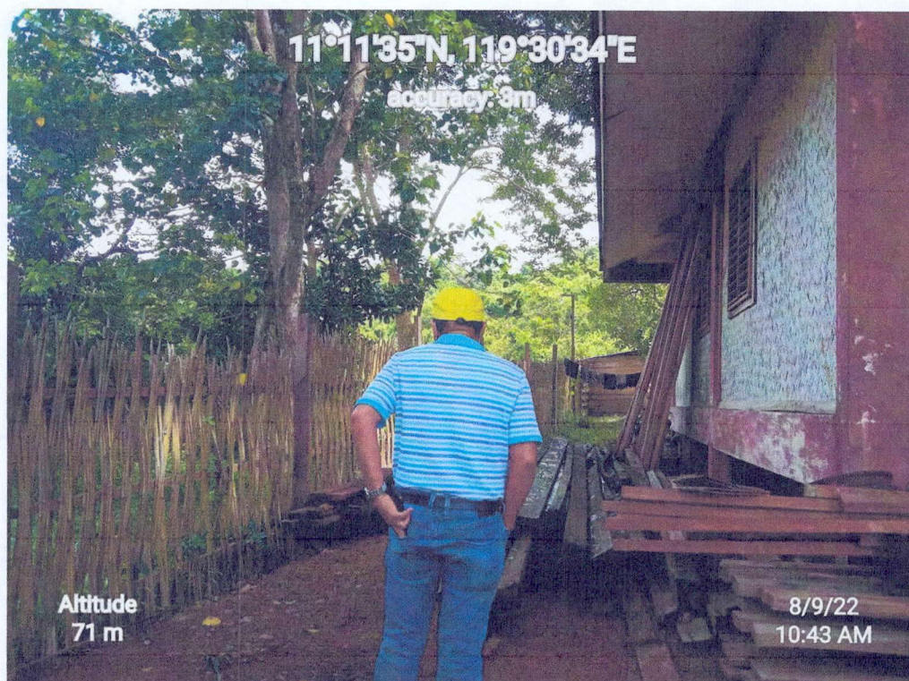
Field visit at FPMS V, Barangay New Ibajay, El Nido, Palawan