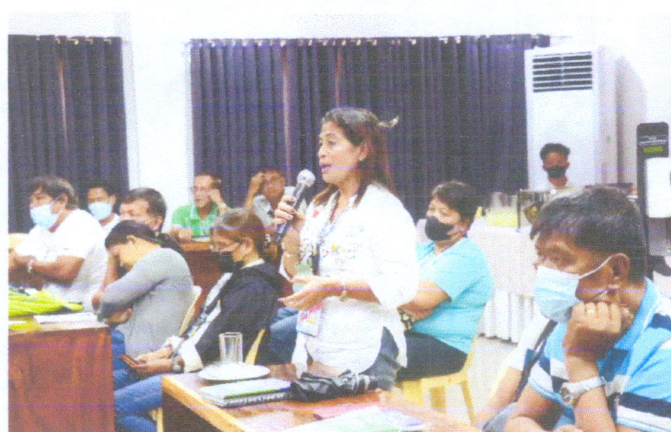
Representatives from various coastal barangays (clockwise: LGU Maniwaya – Santa Cruz, LGU Libtangan - Gasan, LGU Buyabod – Santa Cruz and LGU Caganhao – Boac) raising their concerns during public consultation for VIP establishment