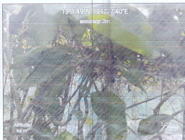
Figure 2. Caterpillar of Idea leucono