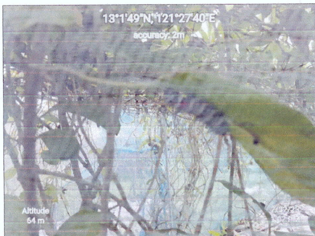
Figure 1. Caterpillar of Idea leucono