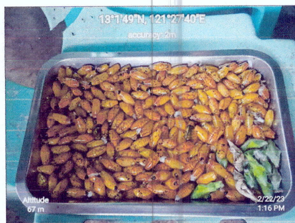
Figure 4. Reject pupae of Idea leucono and Papilio rumanzovia