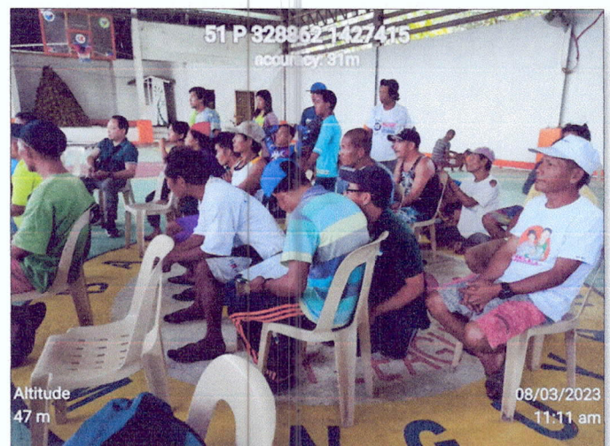
Figures 7 and 8. Photos showing the residents of Brgy. Manguyang Gloria who are attentively listening to the meeting