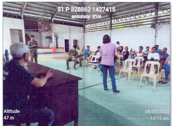
Figures 5 and 6. Photos showing the continuous discussion of the NCIP representatives on the protection and boundaries of IPs ancestral lands