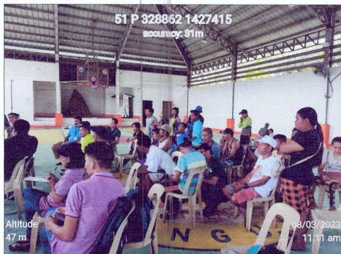
Figures 1 and 2 Residents of Brgy. Manguyang with the NCIP representatives and Philippine Army representative