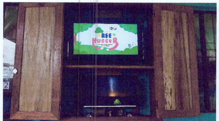
Prescribed banner displayed in Client's information television