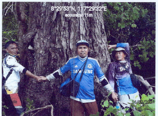
Simultaneous hugging of trees by Monitoring Station personnel