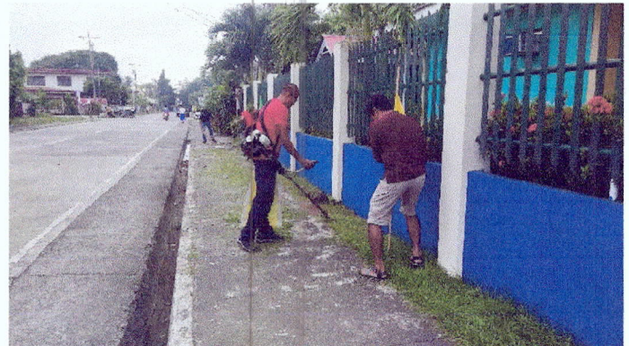
Participation on the simultaneous clean-up spearheaded by LGU Brooke's Point