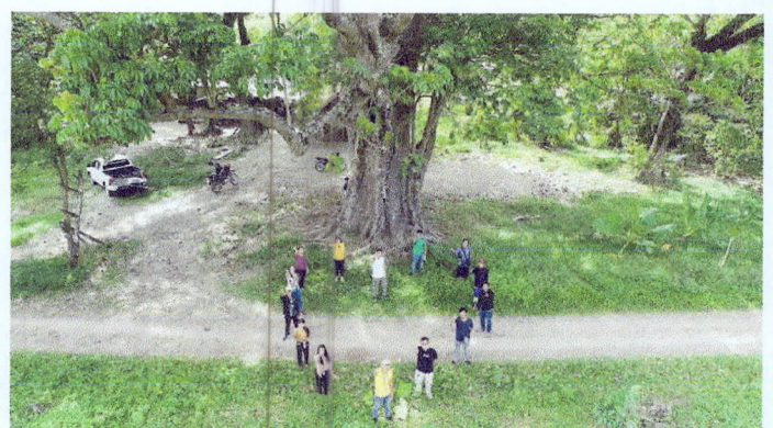
IEC Team with MES personnel hugging a Bubog tree at Sitio Bubog, Barangay Malis, Brooke's Point, Palawan