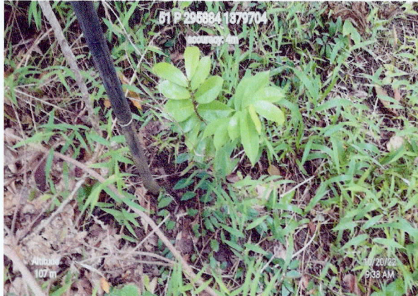
Picture of the Area with the Monitoring Official