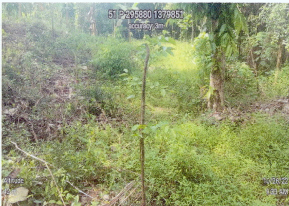
Geotagged Photos before the Monitoring