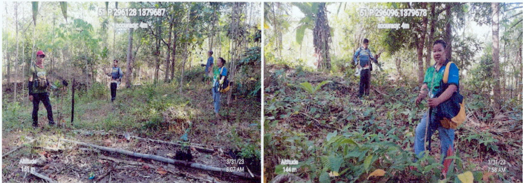
Actual photo taken during the e-NGP site visit represented by OIC, PENR Officer located at Brgy. Batasan, San Jose, Occidental Mindoro.