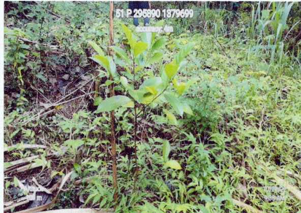
Geotagged Photos before the Monitoring