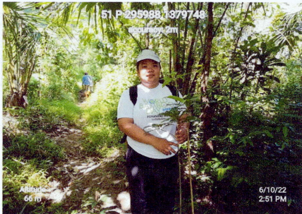
Geotagged Photos before the Monitoring