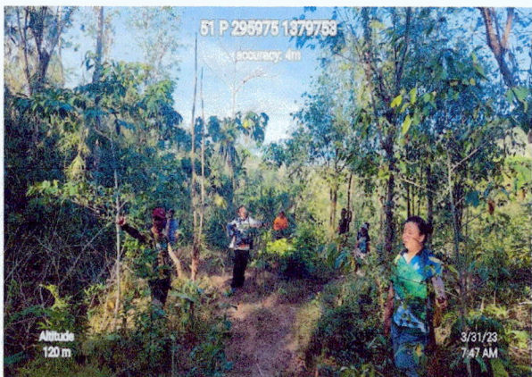
Actual photo taken during the e-NGP site visit represented by OIC, PENR Officer located at Brgy. Batasan, San Jose, Occidental Mindoro.