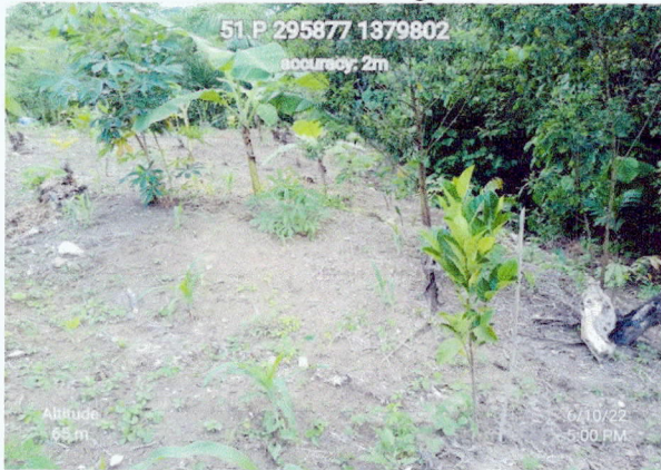
Picture of the Area with the Monitoring Official