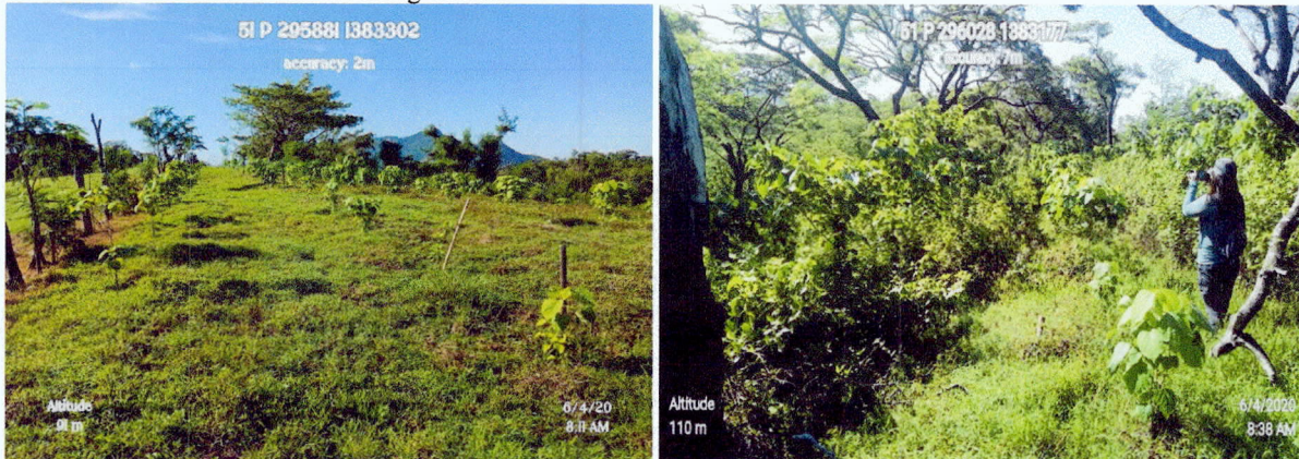
Geotagged Photos before the Monitoring

Picture of the Area with the Monitoring Official