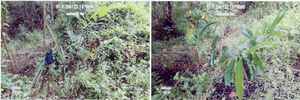
Geotagged Photos before the Monitoring

Picture of the Area with the Monitoring Official