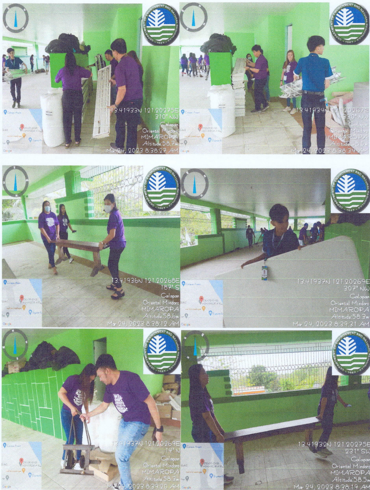
Cleaning of the roof deck area of the office building.