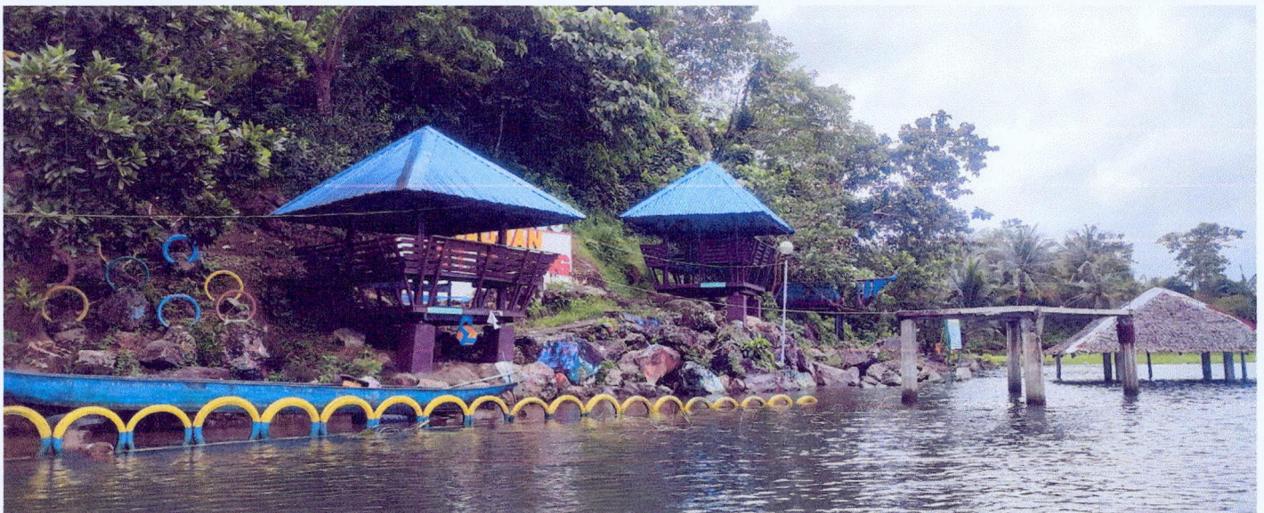
Photos during the monitoring of facilities in Malabo, Victoria on March 8, 2023