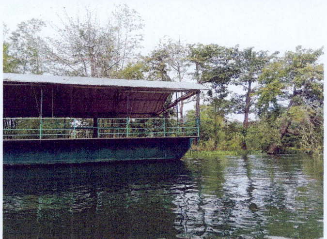
Photos during the monitoring of Bangklase in Bayani, Naujan on February 10, 2023