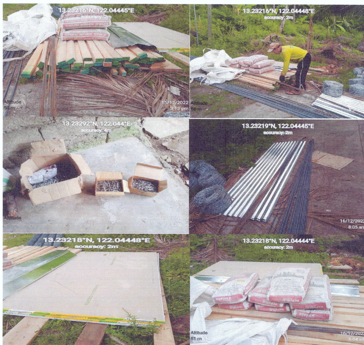
Construction materials delivered for the establishment of forest nursery in Brgy. Dampulan, Torrijos.

Capitol Compound, Barangay Bangbangalon, Boac, Marinduque Telephone Nos.: (042) 332-1490/(042) 332-0727/(042) 332-0927/(042) 332-1913 Website: https://penromarinduque.gov.ph/ Email: penromarinduque@denr.gov.ph