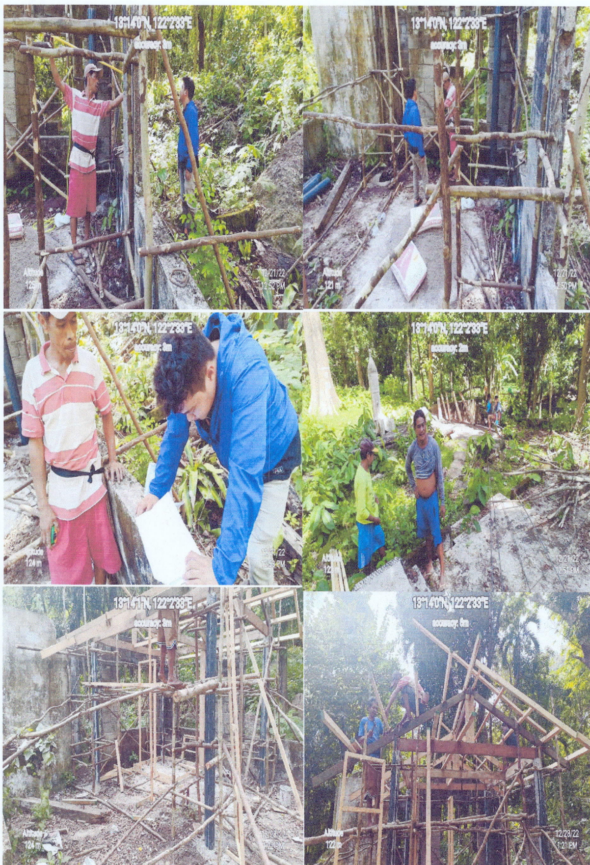
Monitoring of the on-going construction of forest nursery in Brgy. Dampulan, Torrijos.