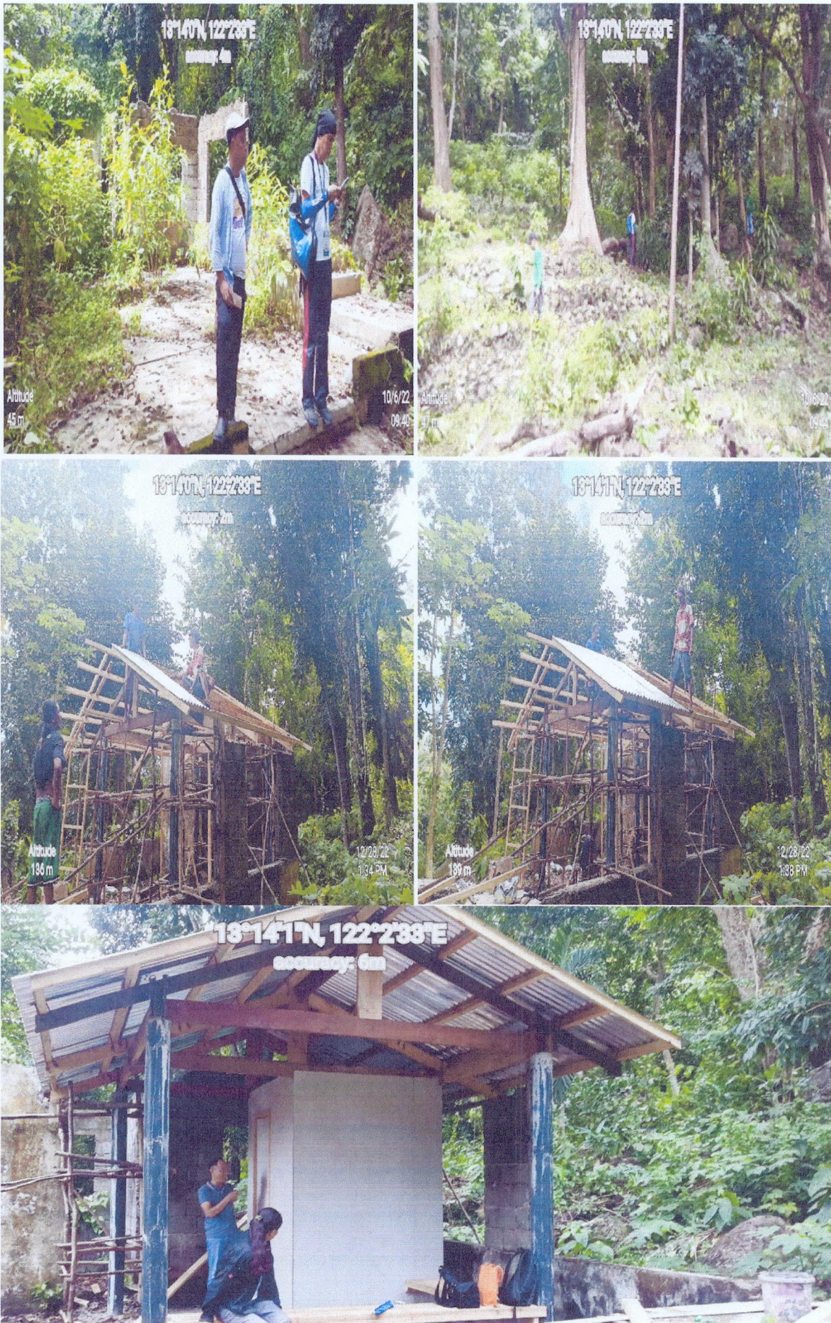
Constructed forest nursery shed in Brgy. Dampulan, Torrijos.