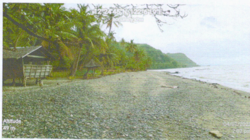
Paroyhog, Sta. Maria