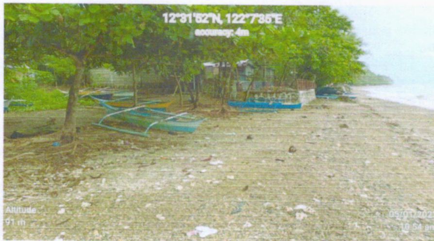
So. Pinamutunan, Binonga-an, San Agustin