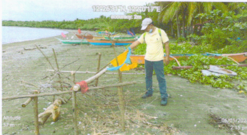
So. Sta. Ana, Tumingad, Odiongan