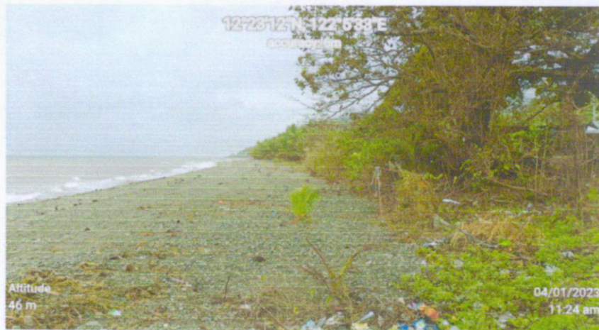
Concepcion Norte, Sta. Maria

Municipality of Sta. Maria, Romblon January 4, 2023