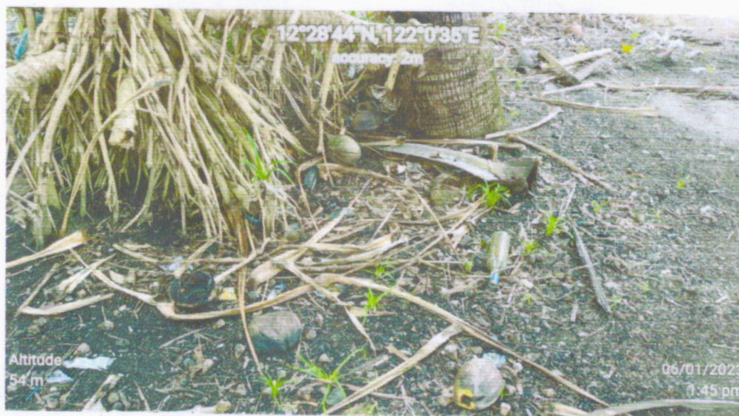
So. Tabing Bundok, Panique, Odiongan

Municipality of Odiongan, Romblon January 6, 2023