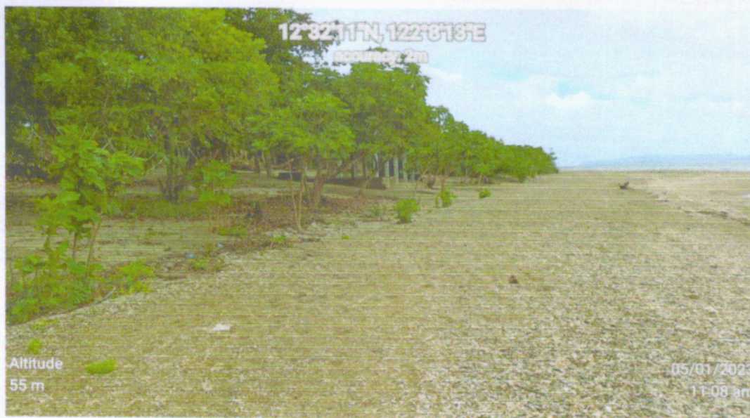
Sitio Bonbon, Binonga-an, San Agustin

Municipality of Odiongan, Romblon January 6, 2023