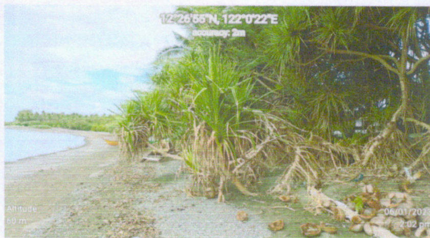
So. Pantay-pantay, Libertad, Odiongan