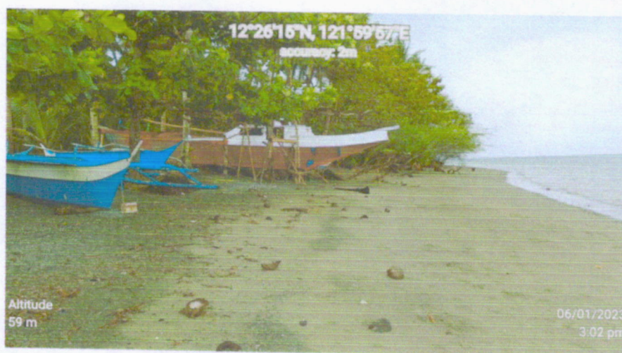
So. Bangar, Gabawan, Odiongan