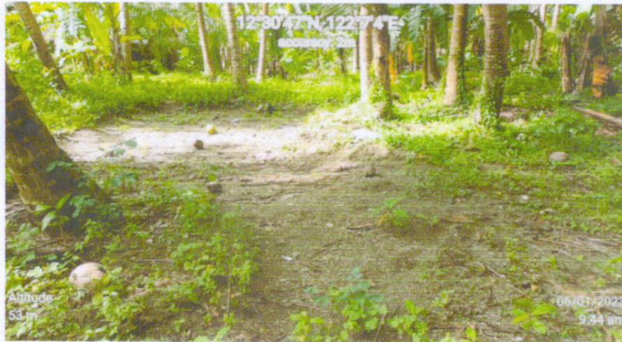
Sitio Centro, Lusong, San Agustin