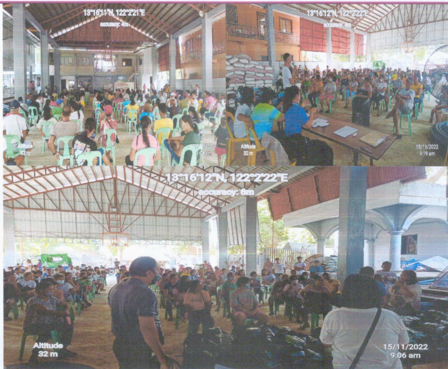
Orientation of DOLE TUPAD beneficiaries held in Brgy. Tigwi, Torrijos, Marinduque