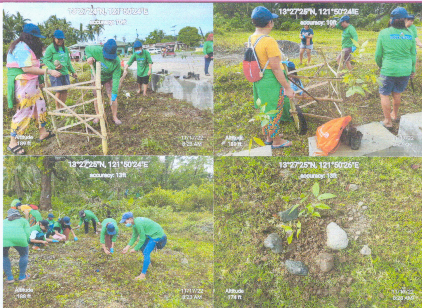
Tree planting activity of DOLE TUPAD beneficiaries in the municipality of Boac