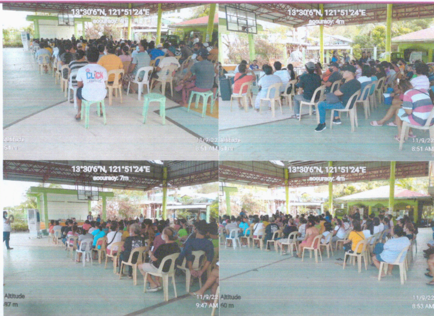
Orientation of DOLE TUPAD beneficiaries held in Brgy. Capayang, Mogpog, Marinduque