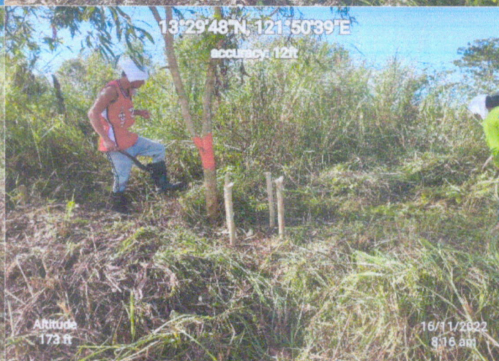
Tree planting activity of DOLE TUPAD beneficiaries in the municipality of Mogpog