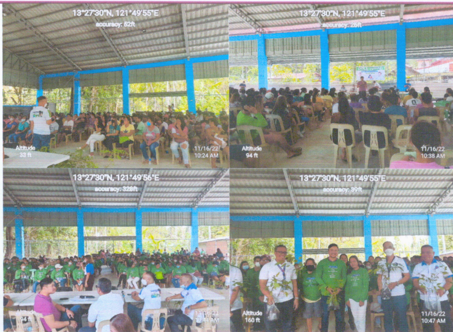
Orientation of DOLE TUPAD beneficiaries held in Brgy. Poras, Boac, Marinduque