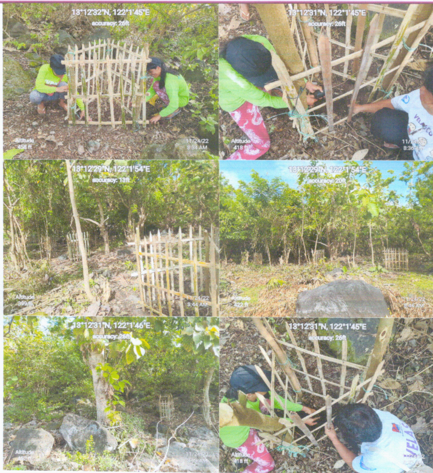
Tree planting activity of DOLE TUPAD beneficiaries in the municipality of Buenavista