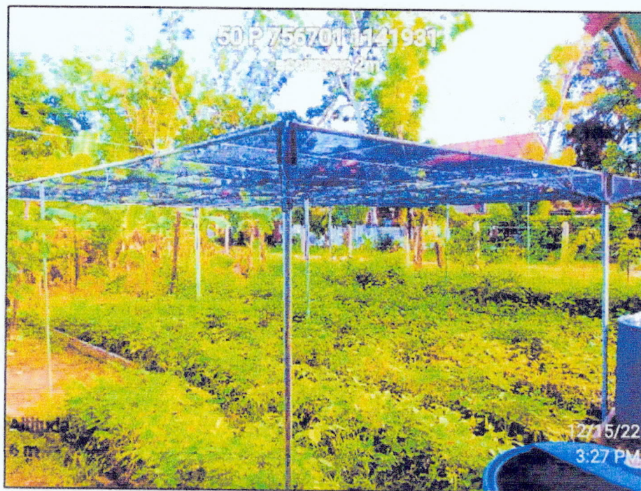
Nursery Sheds and seed beds