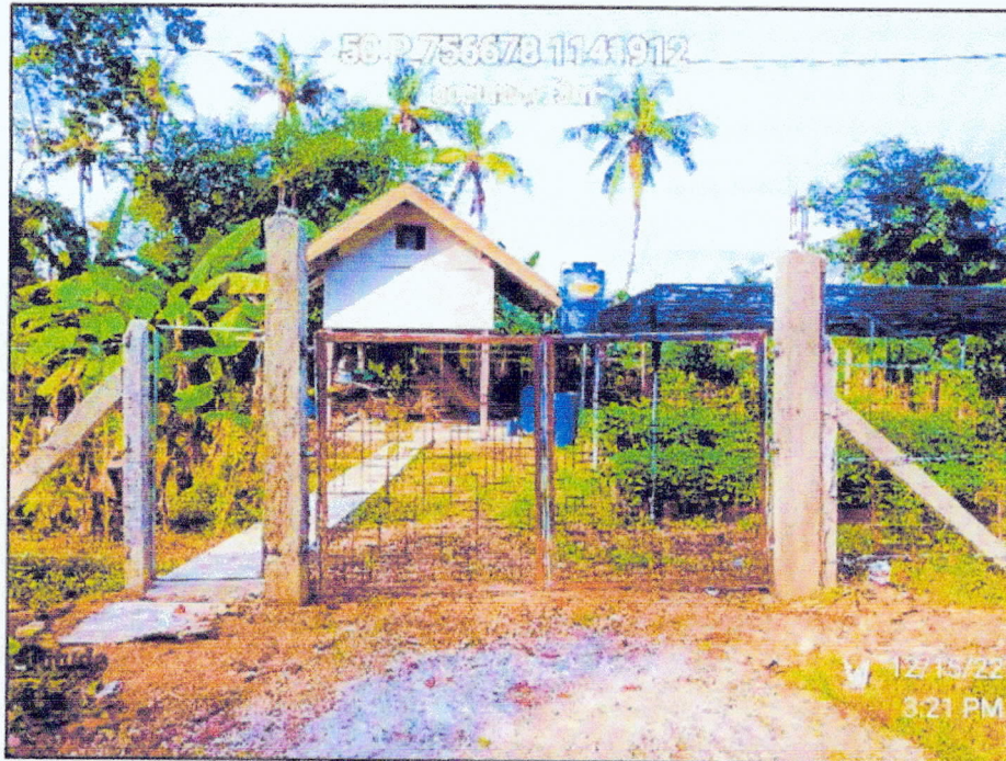
Fence and steel gate