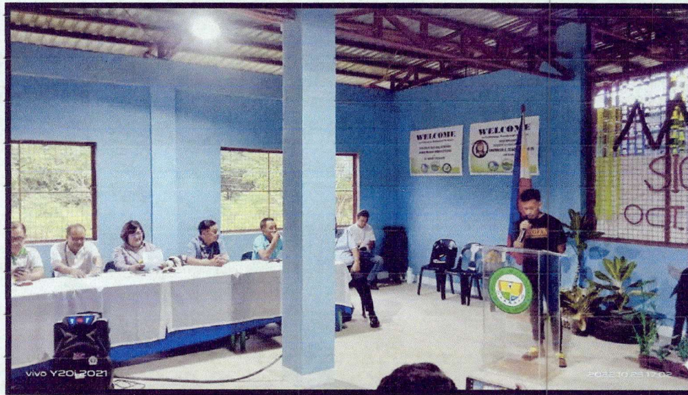
MOA Signing of DENR MIMAROPA and LGU Calintaan launching the Municipality as a Local Chapter of Tayo Ang Kalikasan