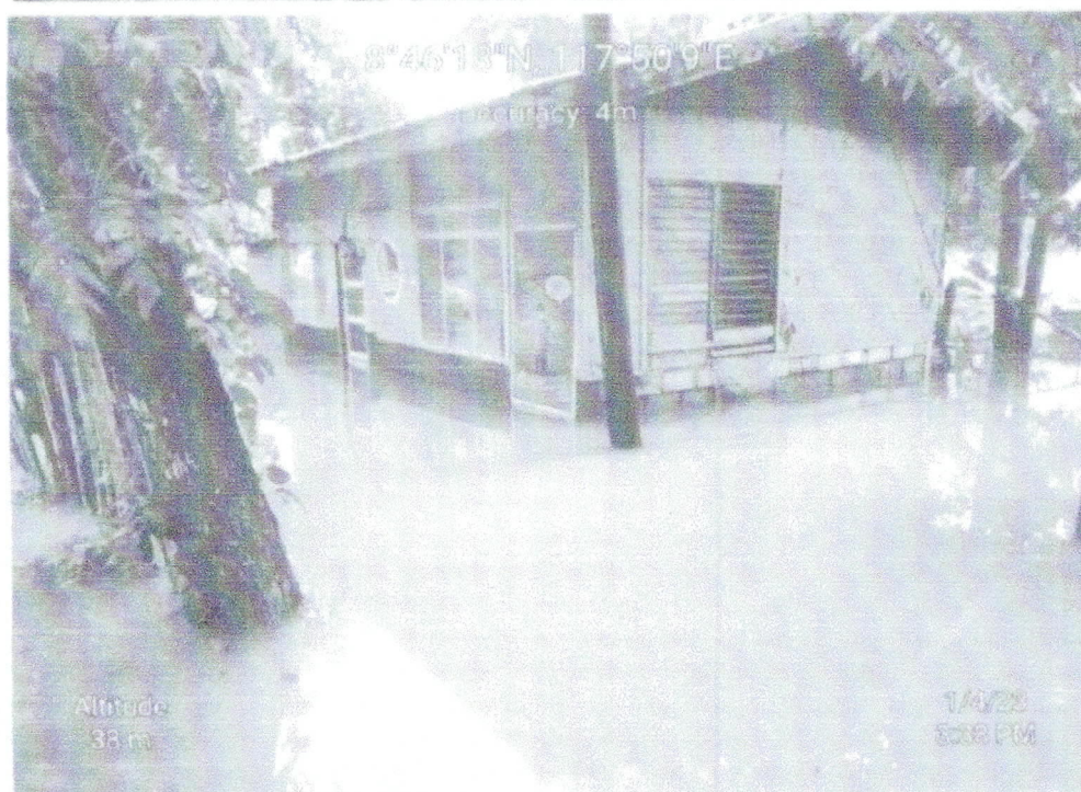
LADA PATROL BASE STATION