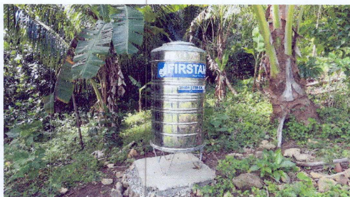
Installed Water storage tank and green house at the forest nursery of CENRO Roxas