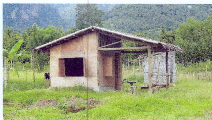
Maintenance of seedlings produced and constructed bunkhouse of CENRO Socorro