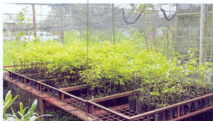
Produced cloned seedlings at Macro-somatic Clonal Nursery