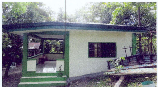
Wildlife Rescue Center (WRC) facilities maintained and improved