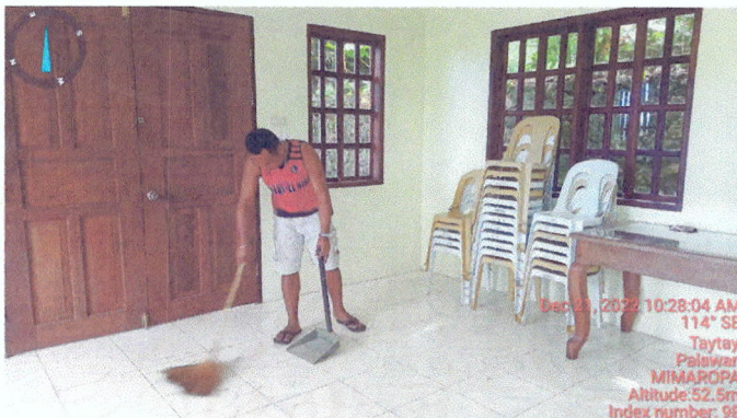
Conference Hall Barangay Poblacion, Taytay, Palawan