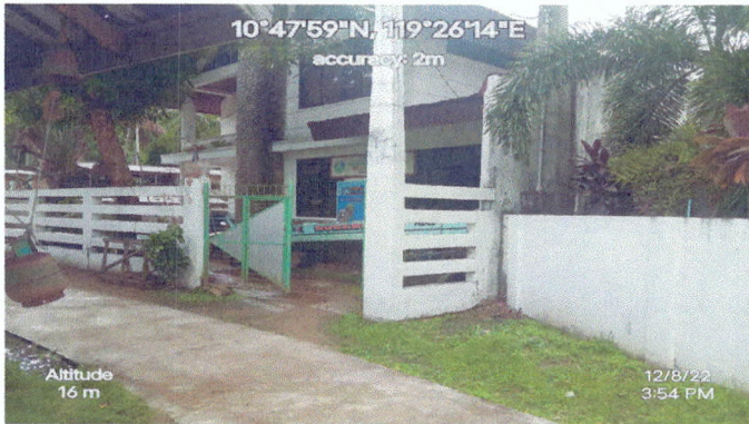
PAMO-MSPLS/FPMS VI, Barangay. Old Guinlo, Taytay, Palawan