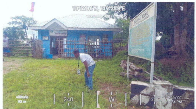
Visitor's Center Barangay Pancol, Taytay, Palawan