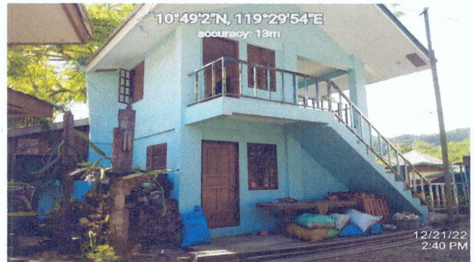
Information Office Barangay Poblacion, Taytay, Palawan