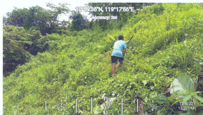
Park Ranger Station Barangay Tumbod, Taytay, Palawan