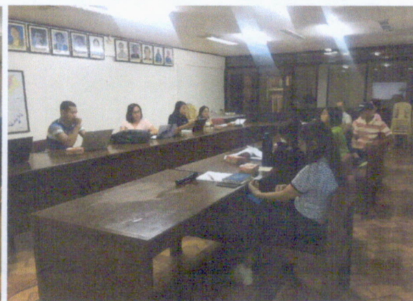
Road Mapping activity for LGU Prioritization for ICM Mainstreaming to CLUP on December 6, 2022 at PENRO Training Hall, Puerto Princesa City, Palawan