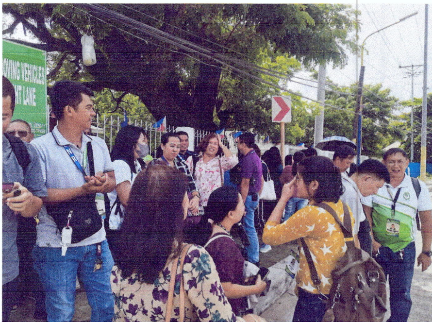
The DENR employees outside the Gender Sensitivity Training venue because of the earthquake (2)