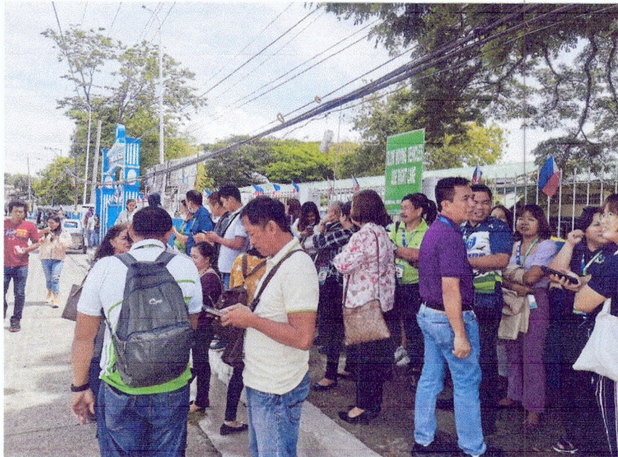
The DENR employees outside the Gender Sensitivity Training venue because of the earthquake (1)