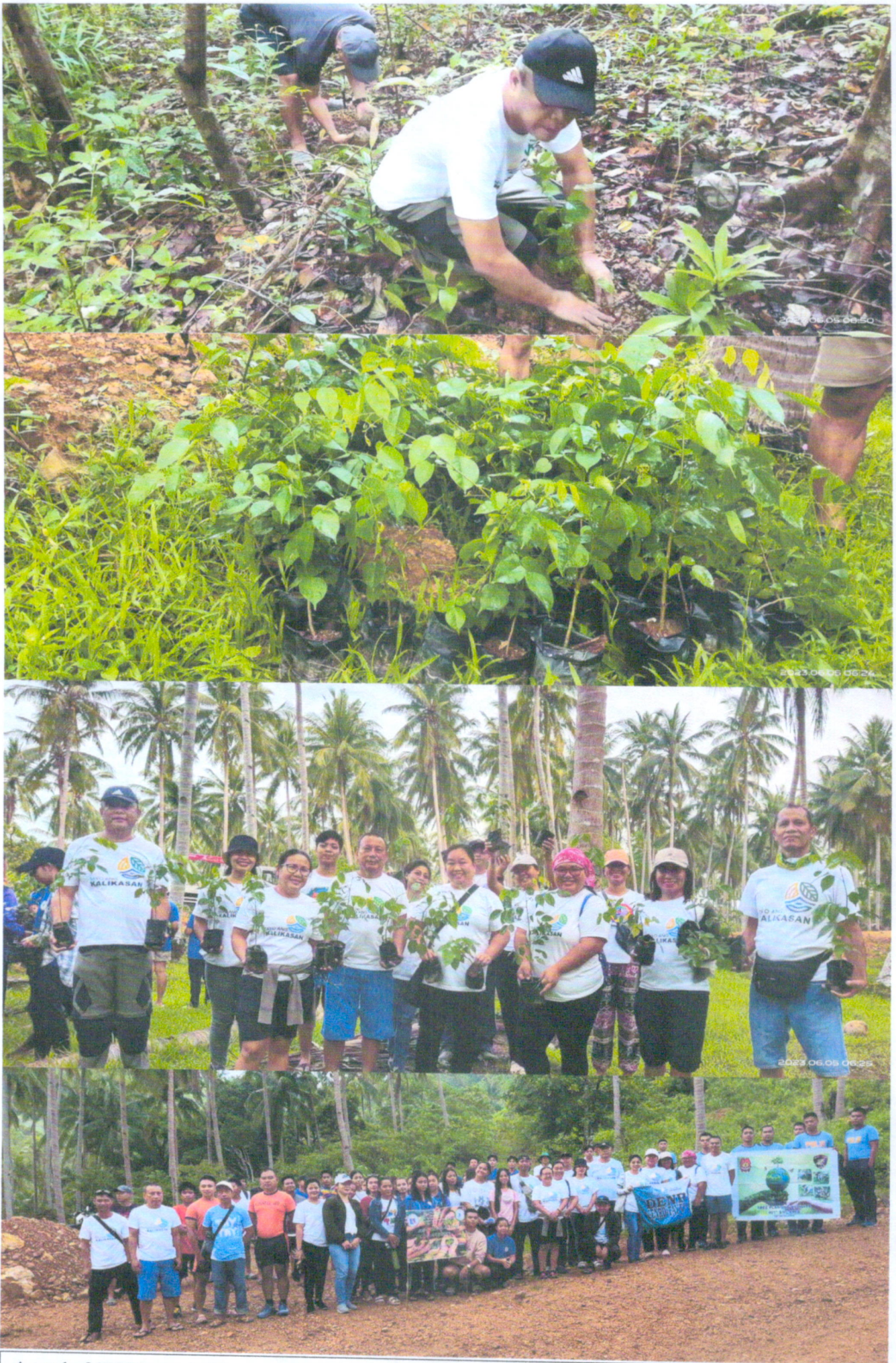
A total of 150 Narra seedlings were planted by 70 individuals (37 male/33 female) composed by the students and faculty of CTSHS-SA Philippine Coastguard (PCG), 401 st B MC, RMFB, DENR CENRO Taytay-El Nido and SAMAGMANALIYA held at Sitio Batas, Poblacion, Taytay, Palawan on June 5, 2023 in observance of World Environment Day.