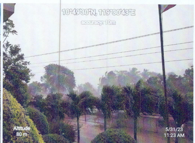
Right photo: To ensure that no debris would cause harm to residents at the height of the typhoon, MENRO, MDRMO and PALECO conducted road side clearing such as cutting branches of trees in the vicinity of Municipal Hall of Taytay, Palawan. Left photo: The weather condition as of 11:23 a.m., May 31, 2023 captured outside the DENR CENRO Taytay Office at Poblacion, Taytay, Palawan.