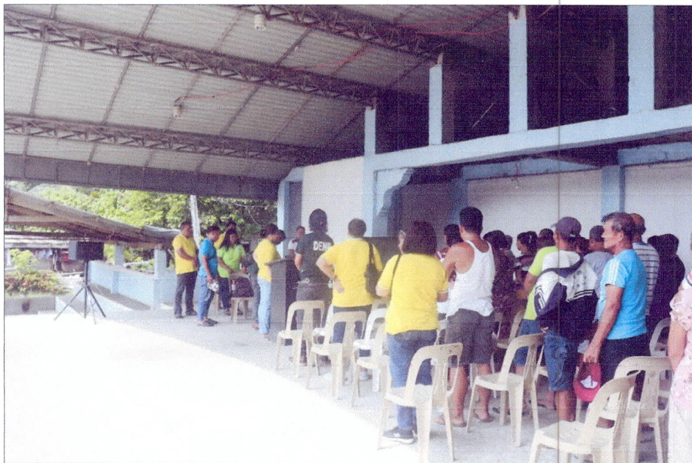
Figure 2. Photo showing the invocation before the actual IEC/ lecture