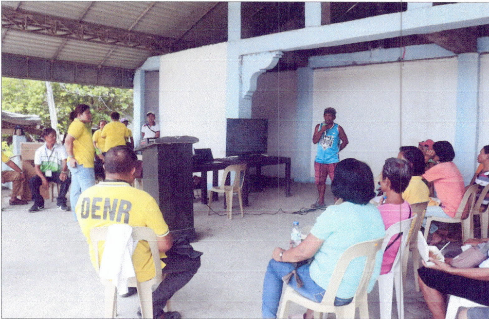
Figure 7. A resident of the barangay asking a question regarding issuance of permit in an assembled chainsaw

Brgy. Tawas, Bongabong, Oriental Mindoro