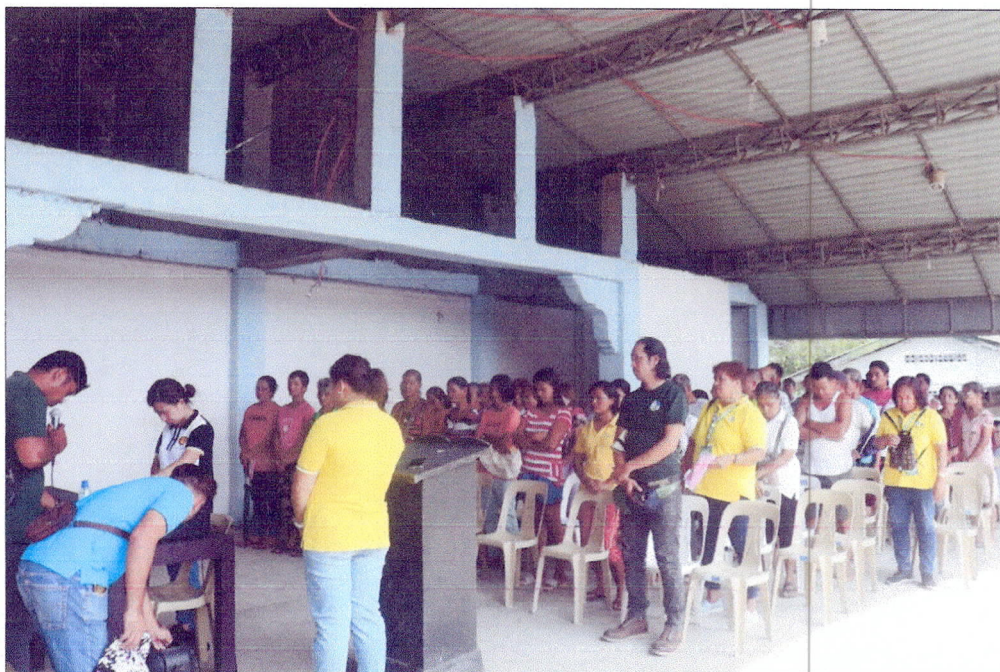
Figure 1. Photo showing the invocation before the actual IEC/ lecture

Brgy. Tawas, Bongabong, Oriental Mindoro