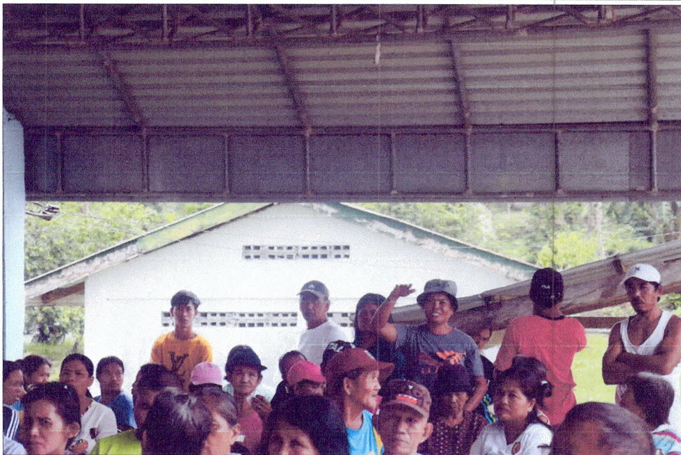
Figure 10. A resident answering the question related to Gender and Development