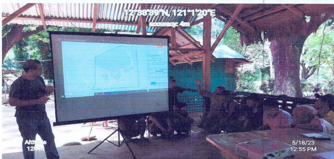
Figure 1. Geotagged Photos taken during public consultation with Taobuid leaders in Magtangcob Station, So. Tamisan, Brgy. Poypoy, Calintaan, Occidental Mindoro on May 18, 2023