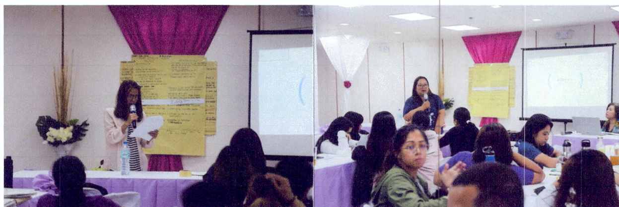
Presentation of the Workshop- Usage of Gender Analysis (HGDG tools