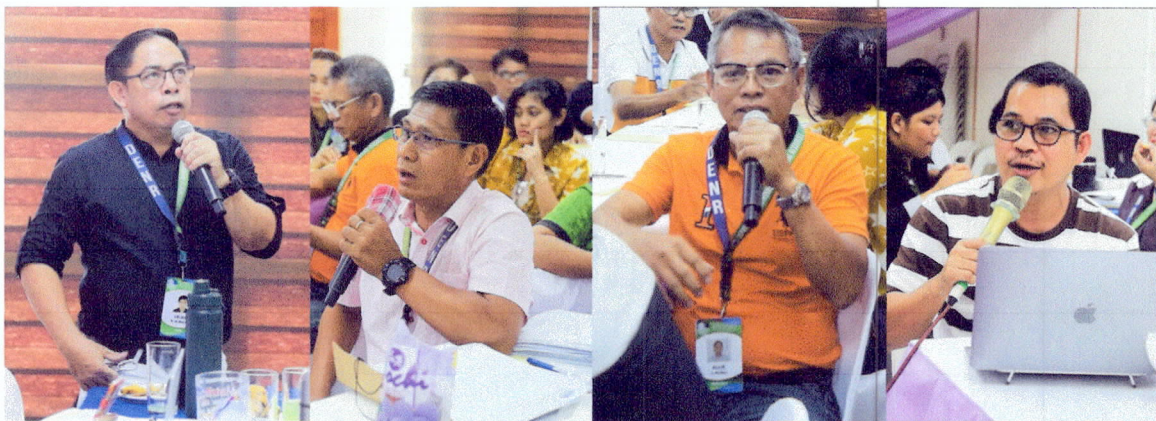
Discussion and Participation