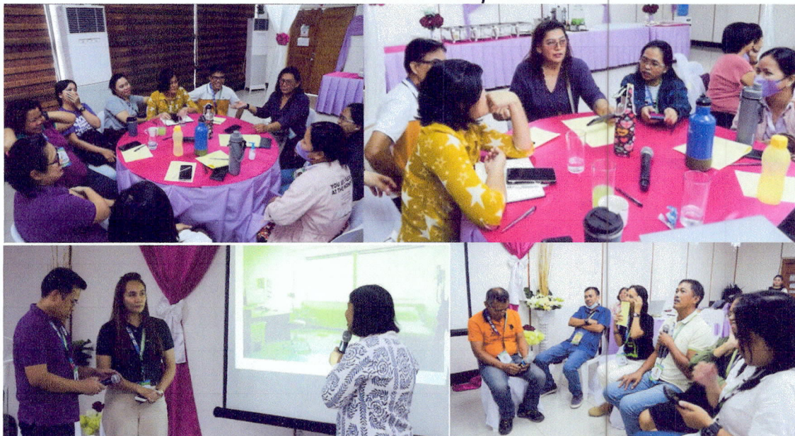
The preparation and the actual role play