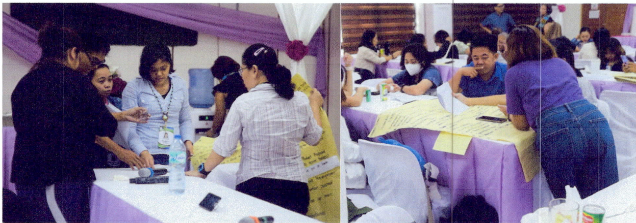
PENRO employees (left) and CENRO San Jose employees (right) during workshop