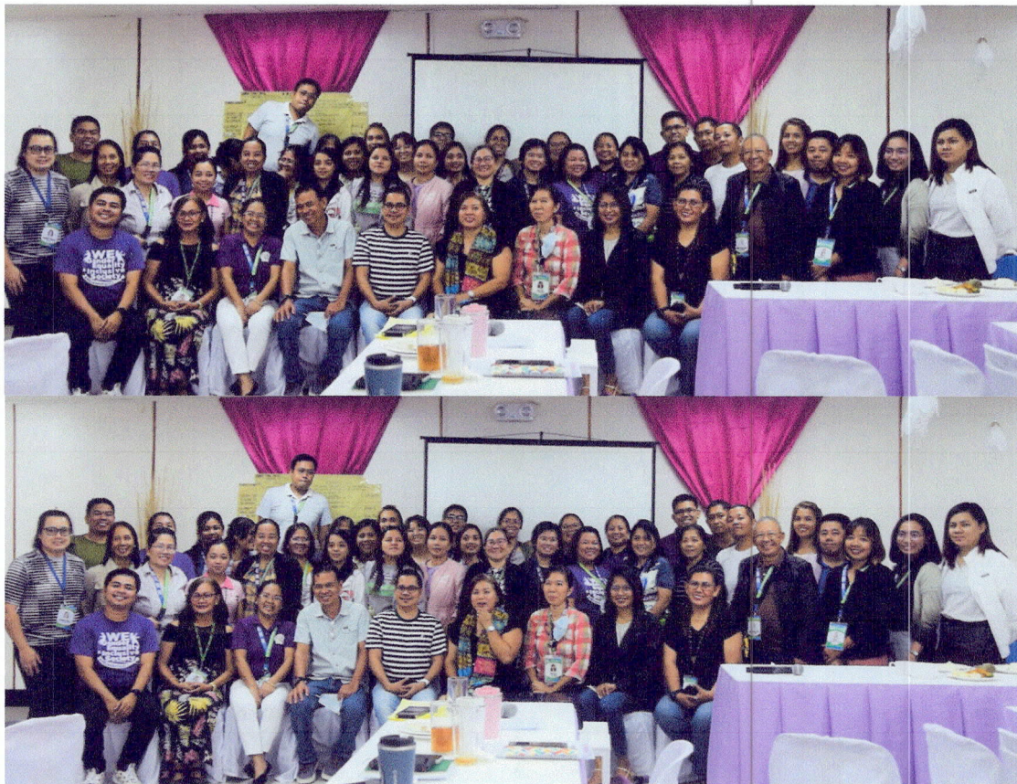
The Participants from CENRO San Jose, CENRO Sablayan and PENRO Mamburao