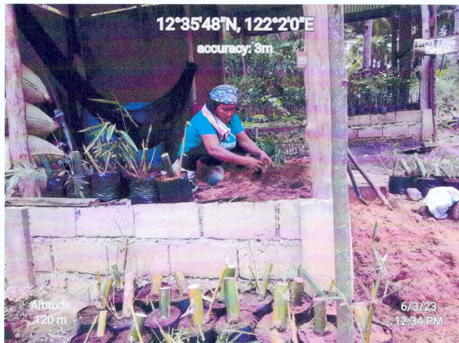
During the propagation of bamboo