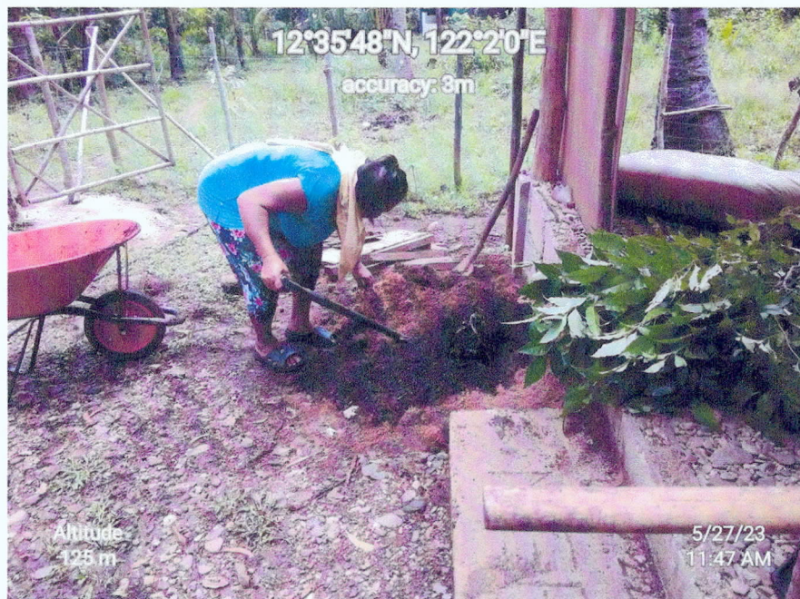
Geotagged photos showing the soil media preparation for seedling production