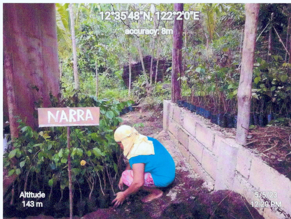
Watering of potted seedlings (above geotagged) and removal of weeds (below geotagged)