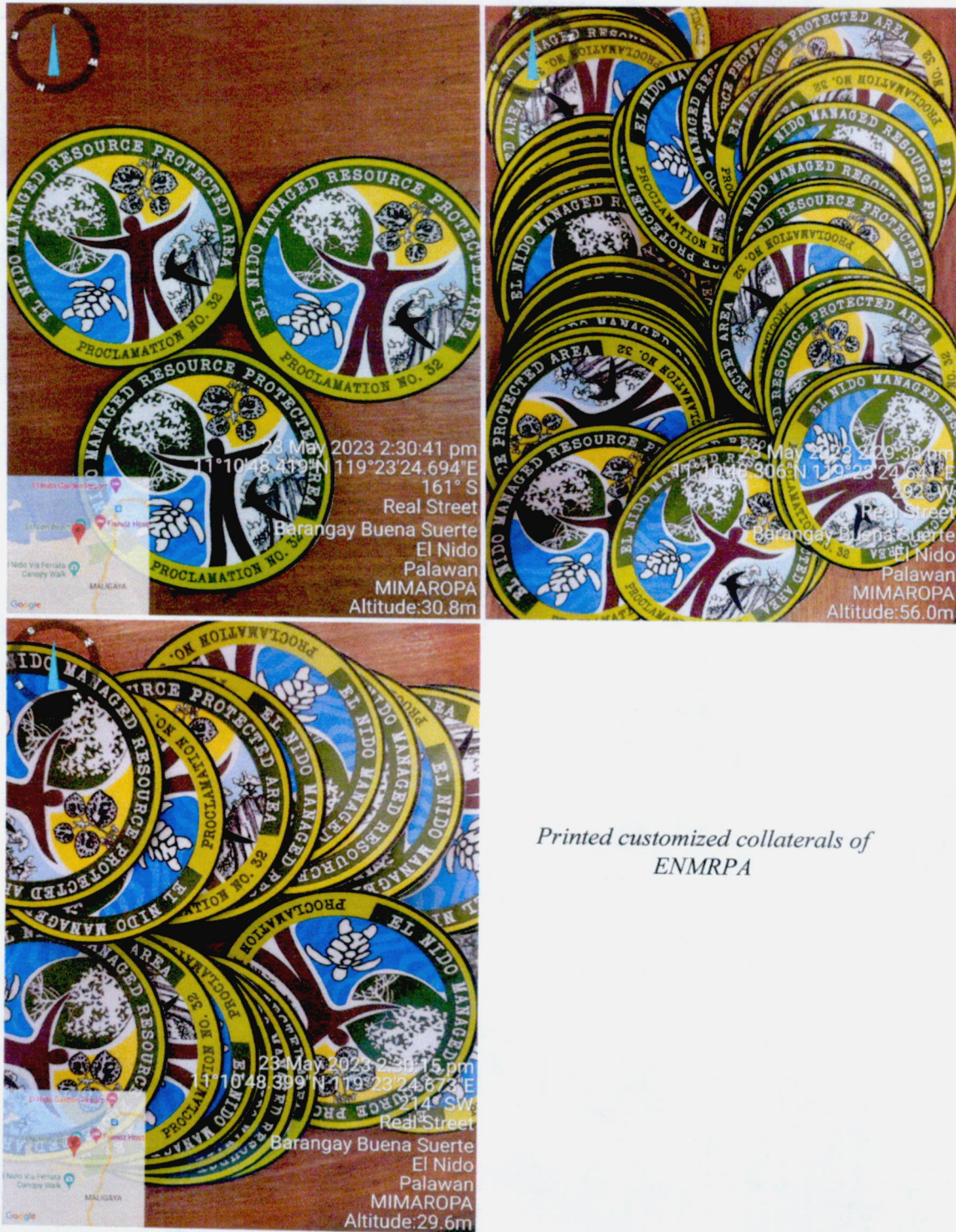
Printed customized collaterals of ENMRPA