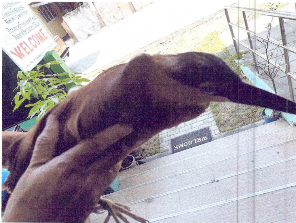
Close up photo of a fauna species called Rufous Night Heron.