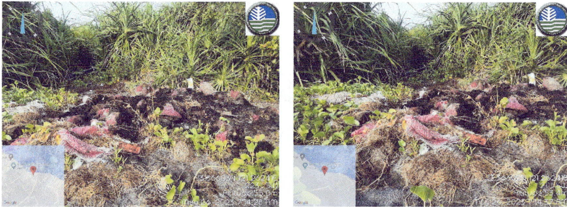
Burned spill boom materials found along shoreline of Navotas

More or less 10 sacks of waste were collected, mostly waste generated from the spill boom materials, cans, and other waste from the residents of the barangay and nearby communities.