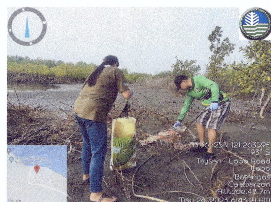
Waste from spill booms scattered and coiled on aroma and mangroves