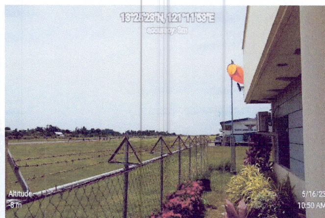
Geo-tagged pictures taken during the Wildlife Traffic Monitoring in Calapan City Airport situated at Brgy. Suqui, Calapan City, Oriental Mindoro