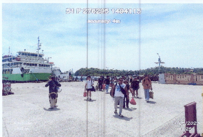
Geo-tagged pictures taken during the conduct of Wildlife Traffic Monitoring in Puerto Galera Seaports located in Barangays of Balatero and Muelle, Puerto Galera, Oriental Mindoro