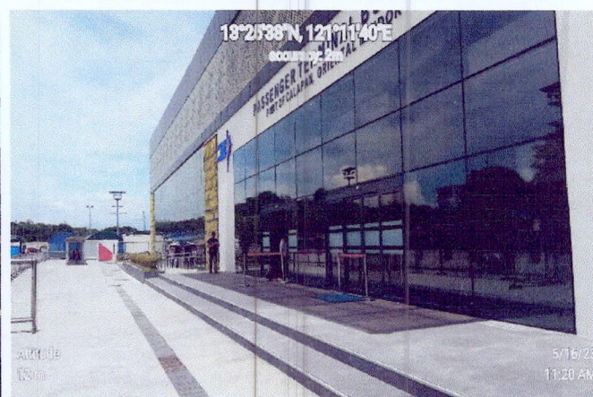
Geo-tagged pictures taken during the Wildlife Traffic Monitoring in Calapan City Seaport located at Brgy. San Antonio, Calapan City, Oriental Mindoro