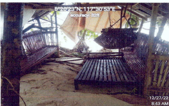
Above photos: Showing the facilities after the shear line/strong waves