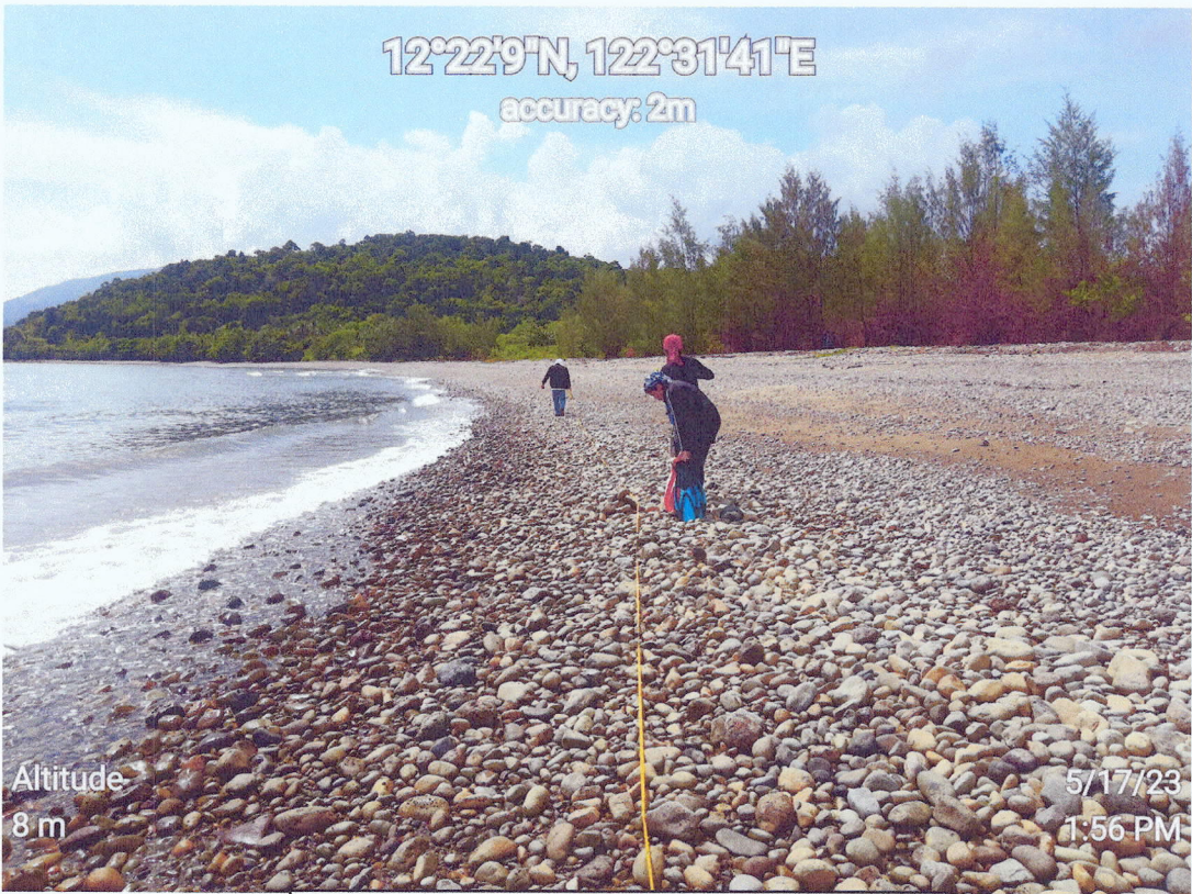
Sea Grass Assessment