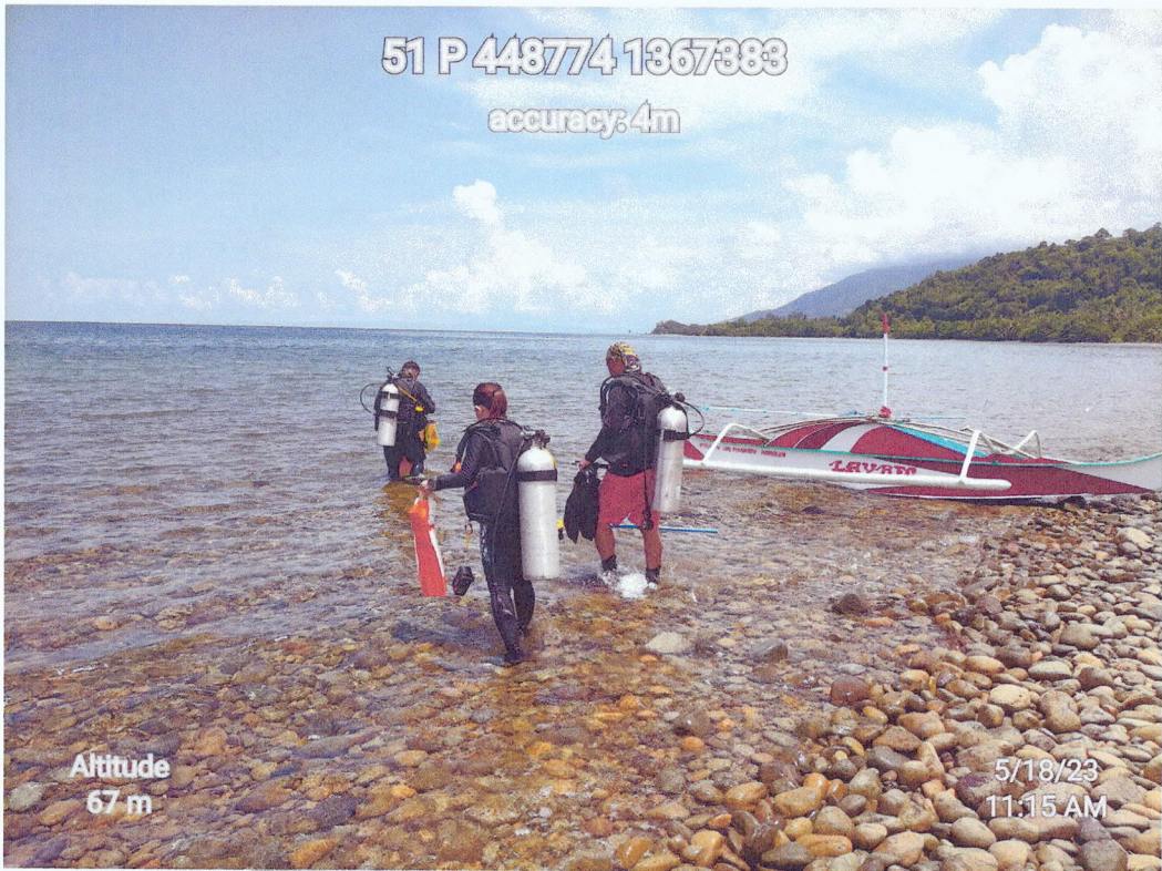
Coral Reef Assessment