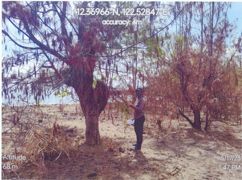
Beach Vegetation within the Salvage Zone