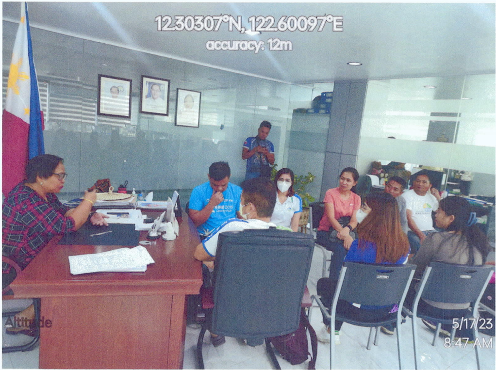
Coordination with Mayor Nannette Tansingco of LGU San Ferndo, Romblon