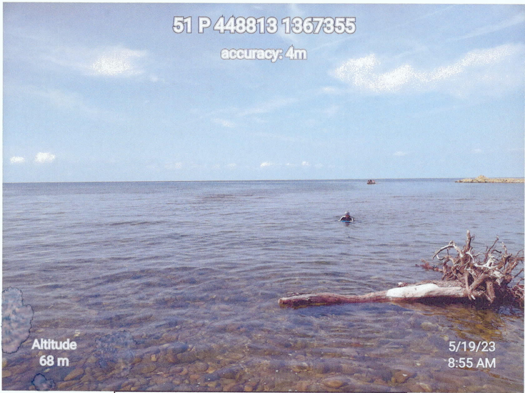
Sea Grass Assessment