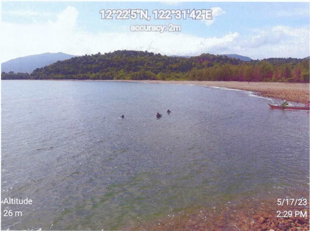
Coral Reef Assessment