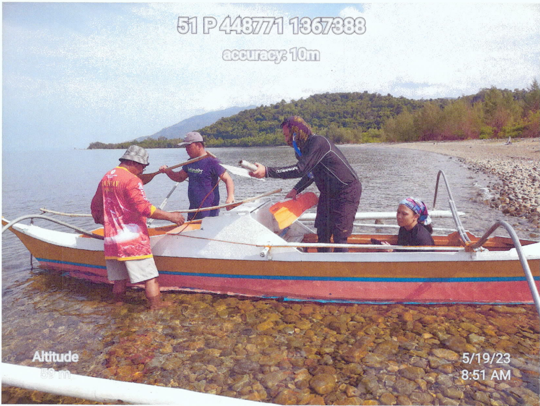
Coral Reef Assessment