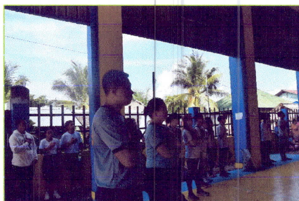
Philippine National Police and Other Participants Singing the Philippine National Anthem