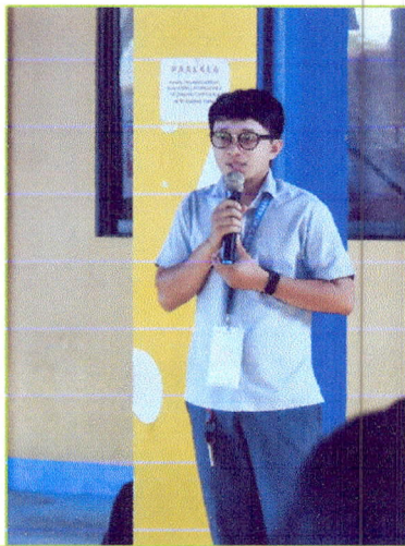
Representative from LGU Gasan Delivering His Message During the CEPA Campaign