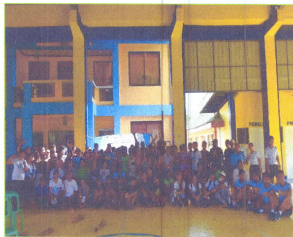
Photo Opportunity of Coastal Clean Up Participants prior the CEPA Campaign