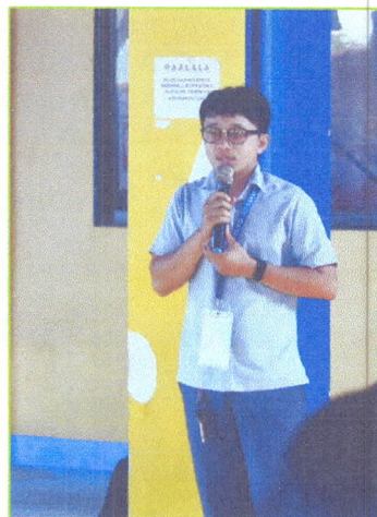
Representative from LGU Gasan Delivering His Message During the CEPA Campaign