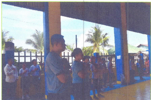
Philippine National Police and Other Participants Singing of Philippine National Anthem