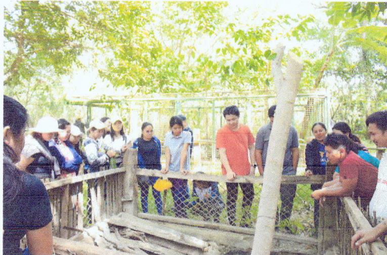
PENRO employees looking at the Malayan Box Turtles