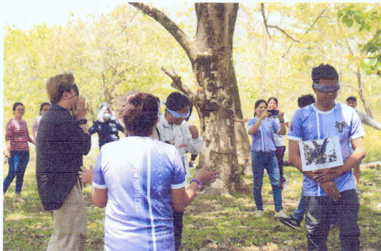
"Chip-chip, kleeek-kleeek" Find your partner through sound!