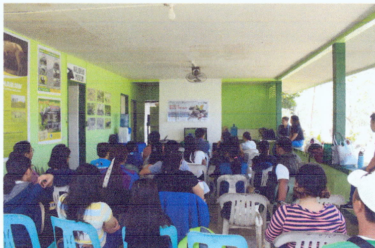
The participants watching an educational video about tamaraws