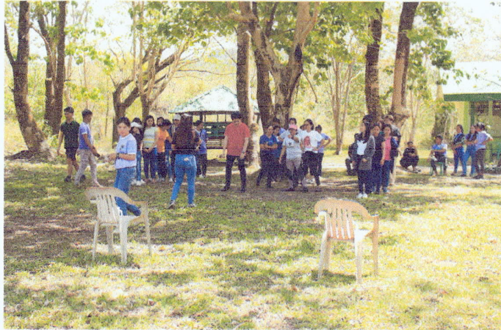
A group game, "Biodegradable or Non-biodegradable!"