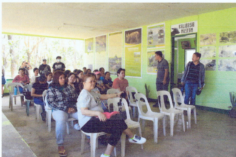
A lecture on Mindoro Biodiversity