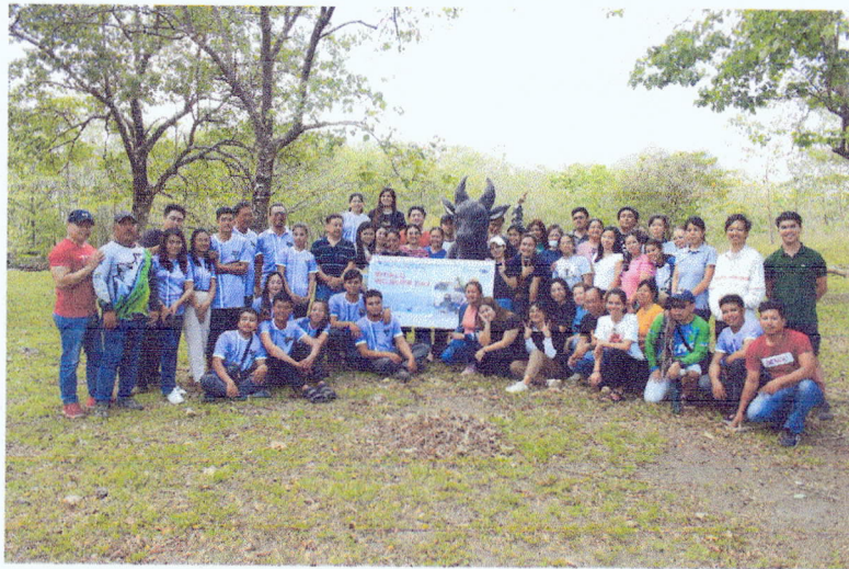
Group photo of the participants with Tam-Tam (the tamaraw mascot)