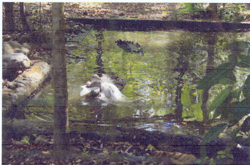
One of the two rescued crocodiles in the photo eating a duck

So. Pag-asa, Brgy. Payompon, Mamburao, Occidental Mindoro E-mail: penrocc.mindoro@denr.gov.ph