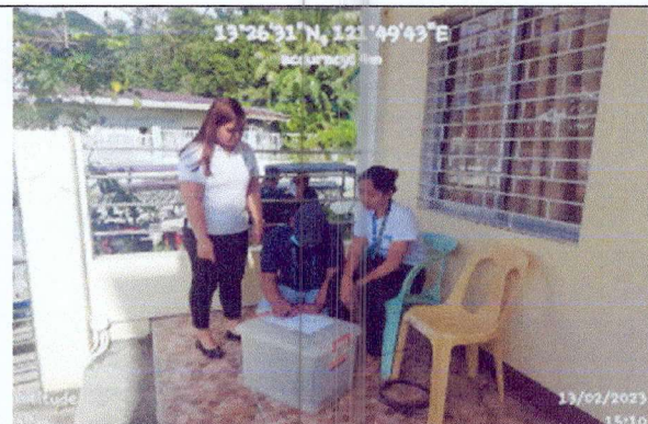
Turned-over Reticulated Python and releasing it at the vicinity of MWRC.