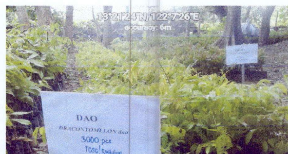
Turned-over indigenous seedlings from Contactors for road widening and Private Land Timber Permittee (PLTP).