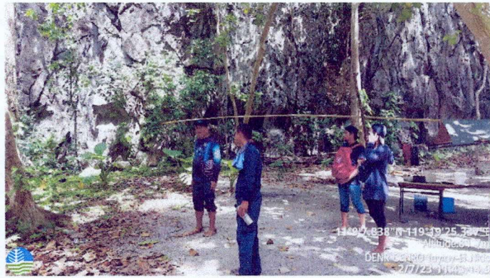
Monitoring at Big Lagoon, Barangay Bebeladan, El Nido, Palawan