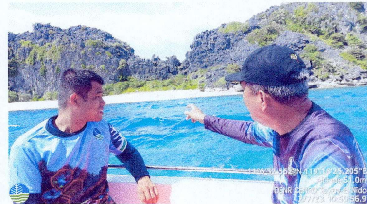
Monitoring at Turtle Island, Barangay Bebeladan, El Nido, Palawan