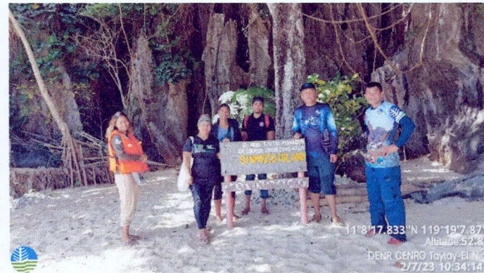
Monitoring at Shimizu Island, Barangay Bebeladan, El Nido, Palawan