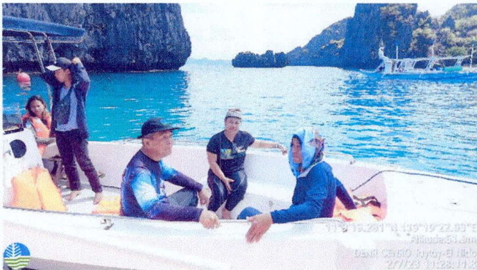
Monitoring at Small Lagoon, Barangay Bebeladan, El Nido, Palawan