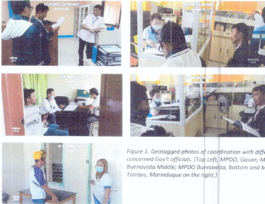
Figure 1. Geotagged photos of coordination with different concerned Gov't officials. (Top Left, MPDO, Gasan; MAO Buenavista Middle; MPDO Buenavista, bottom and MPDO Torrijos, Marinduque on the right.)