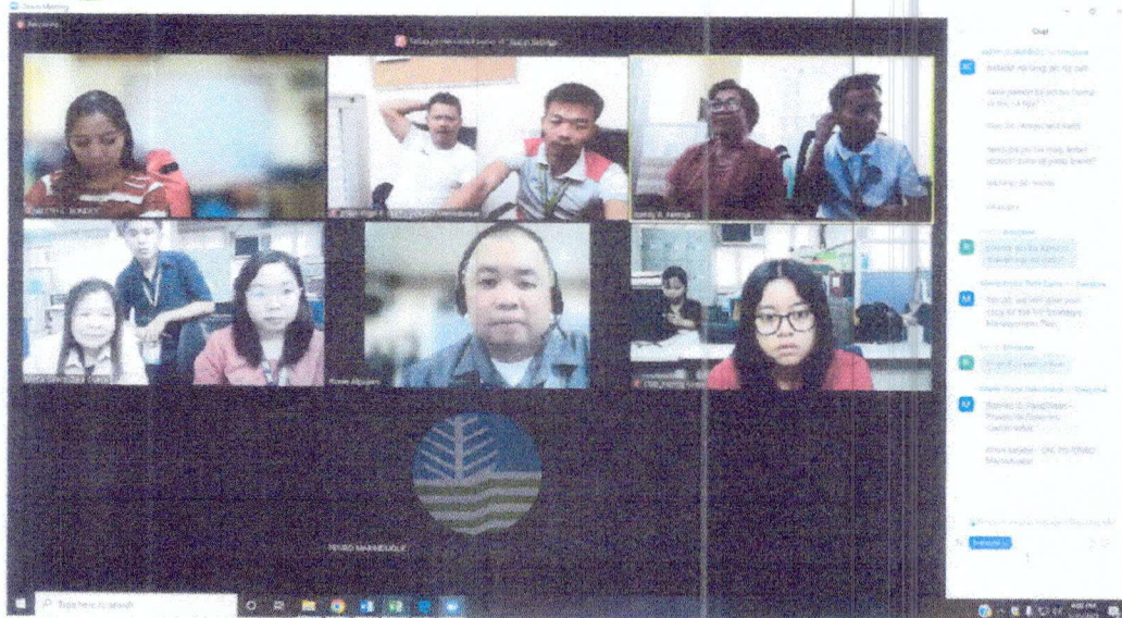
Figure 3. Photo showing the participants attended during the ICM mainstreaming Orientation meeting via zoom on January 31, 2023.