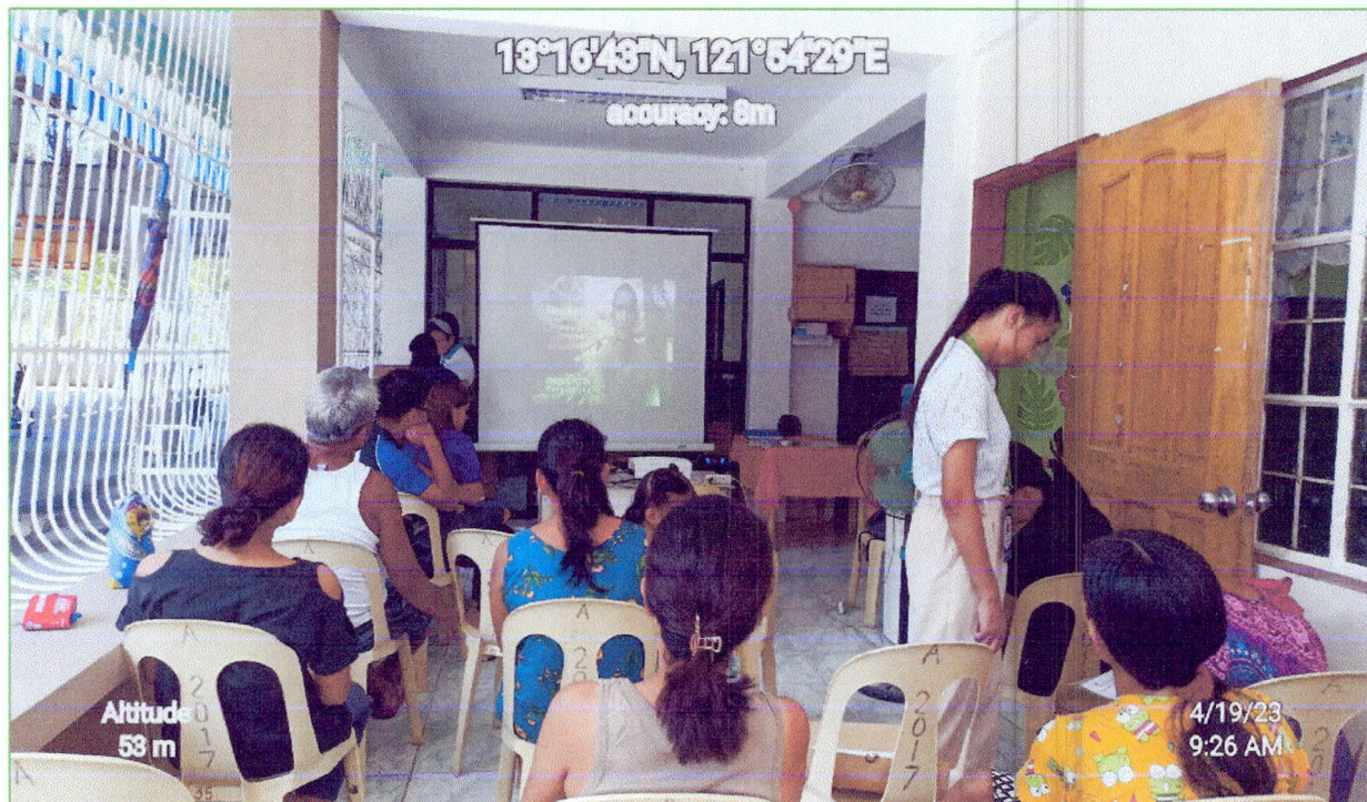
Photos on the activity conducted at Brgy. Antipolo, Gasan, Marinduque on April 19, 2023 re short movies on the success story of “ Tayo ang Kalikasan ” and Enhanced - National Greening Program (E-NGP) successful project of Barangay Sibuyao, Torrijos, Marinduque