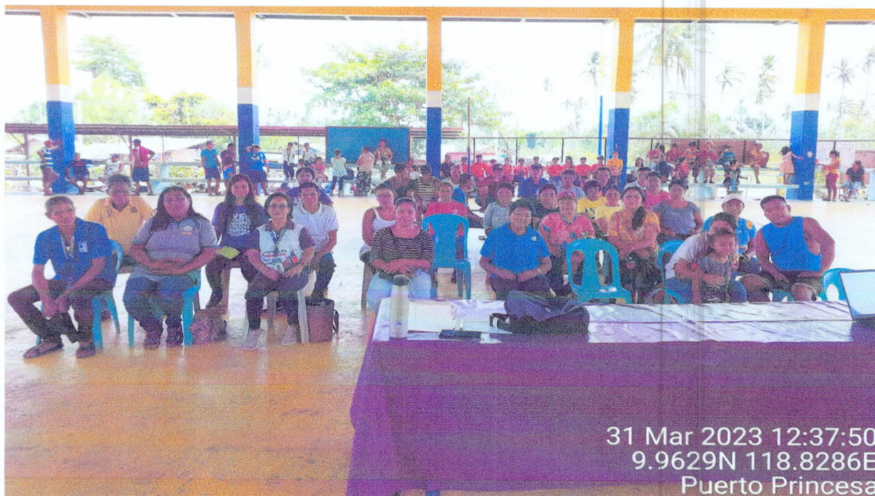
Group picture with the fisherfolks.