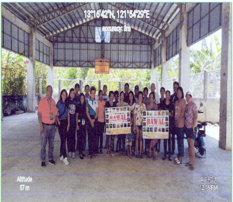
Group picture together with Barangay Local Government Unit (BLGU)- Antipolo, Gasan, Marinduque