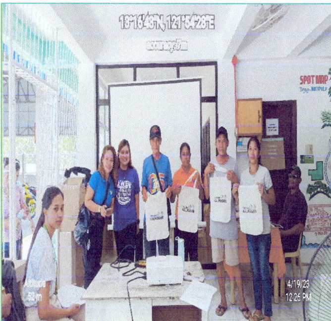
Distributed of Tote Bag "Tayo ang Kalikasan"