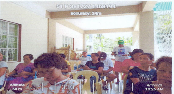
Geo-tagged photos during Communication Education and Public Awareness in Barangay Antipolo, Gasan, Marinduque on April 19, 2023