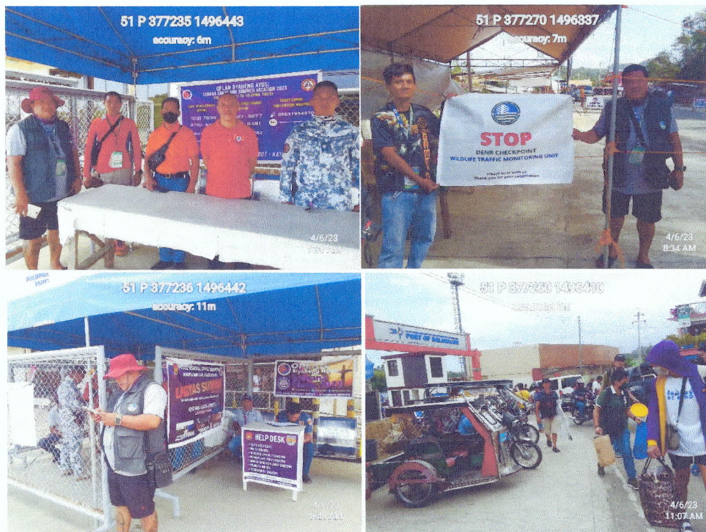
Monitoring inside and outside the Balanacan Port premises – April 06, 2023