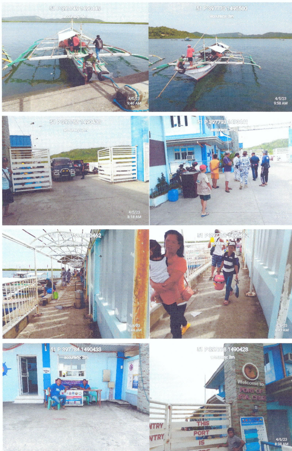
Monitoring of passenger in Buyabod port – Passengers going to Quezon and to Maniwaya ang Mongpong Island, Sta. Cruz, Marinduque – April 05 to 06, 2023