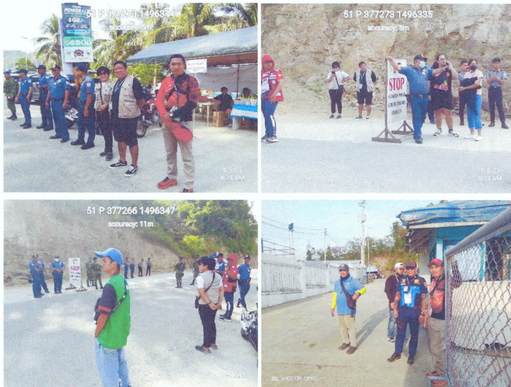
Monitoring of Balanacan Port - April 08, 2023