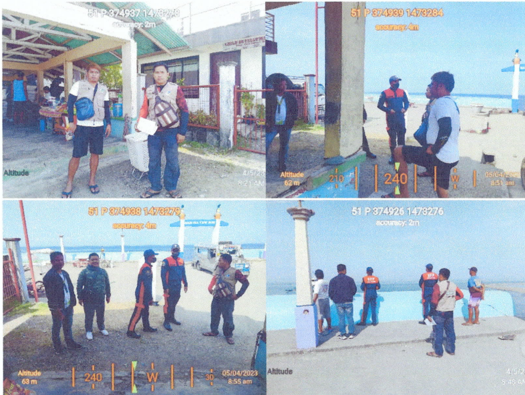
Monitoring in Gasan Port – April 05, 2023