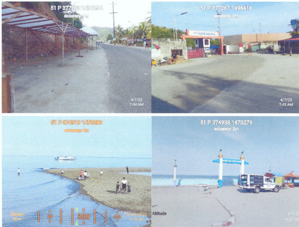
Temporary cancellation of trips in Balanacan and Gasan Port – April 07, 2023