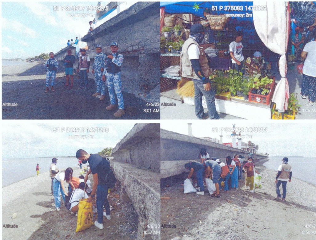
Monitoring and clean-up in Gasan including the inspection of some ornamental plants vendors – April 06, 2023