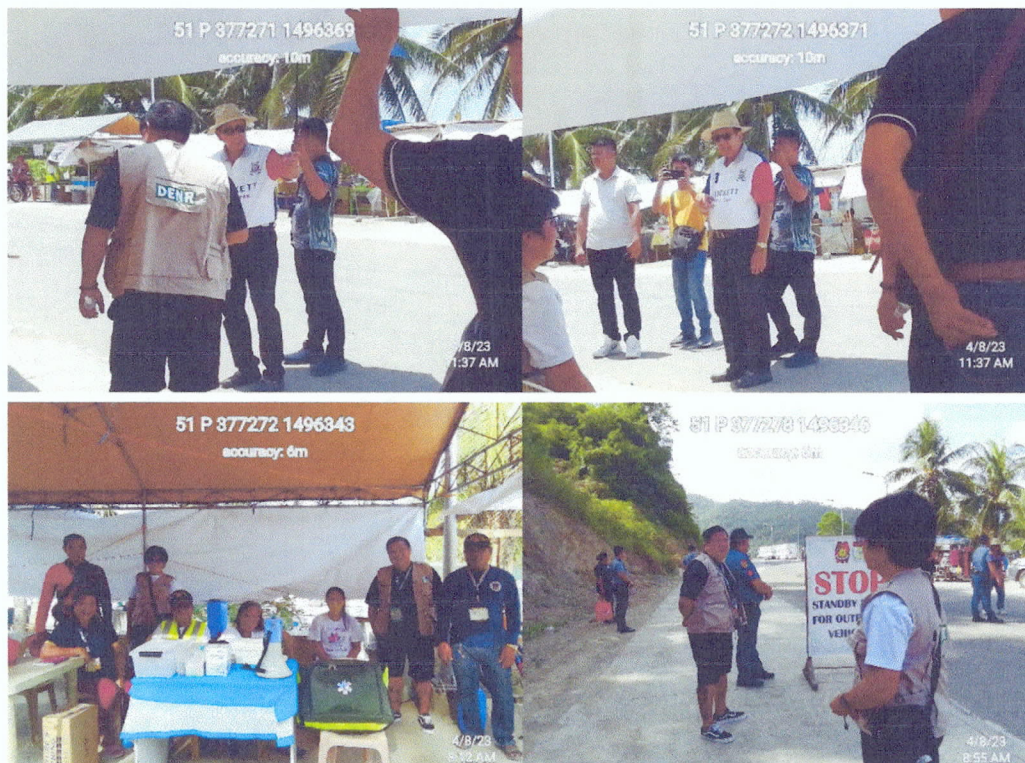
Monitoring in Balanacan Port including the visit of Ho. Governor Presby Velasco - April 08, 2023