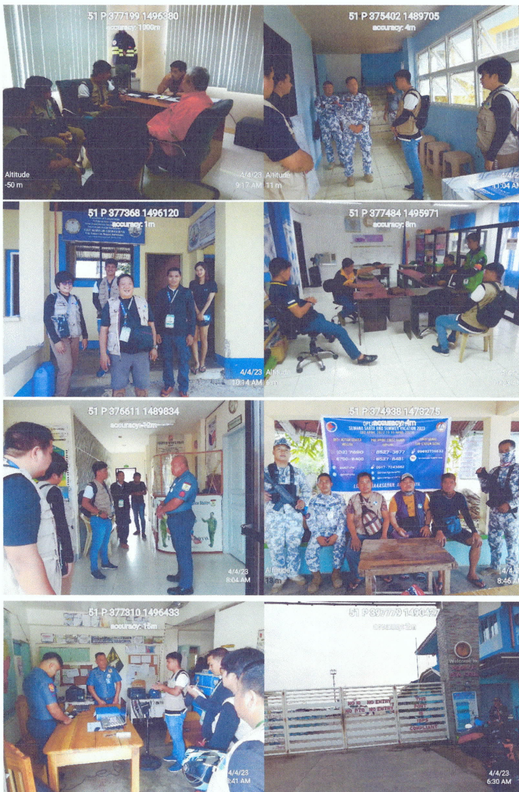
Photo captured during the coordination to other agencies regarding the mobilization of the DENR PENRO Marinduque Quick Response Team.