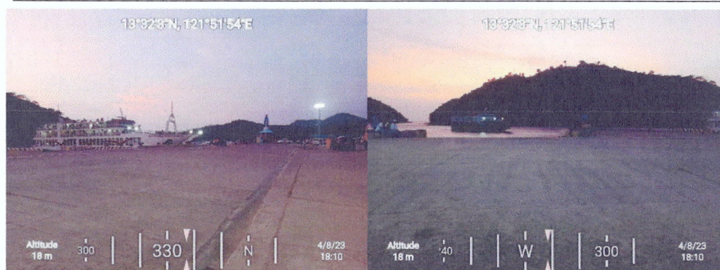
Monitoring of Balanacan Port on night – April 08, 2023

Capitol Compound, Barangay Bangbangan, Boac, Marinduque Telephone Nos.: (042) 332-1490/(042) 332-0727/(042) 332-0927/(042) 332-1913 Website: https://penromarinduque.gov.ph/ Email: penromarinduque@denr.gov.ph