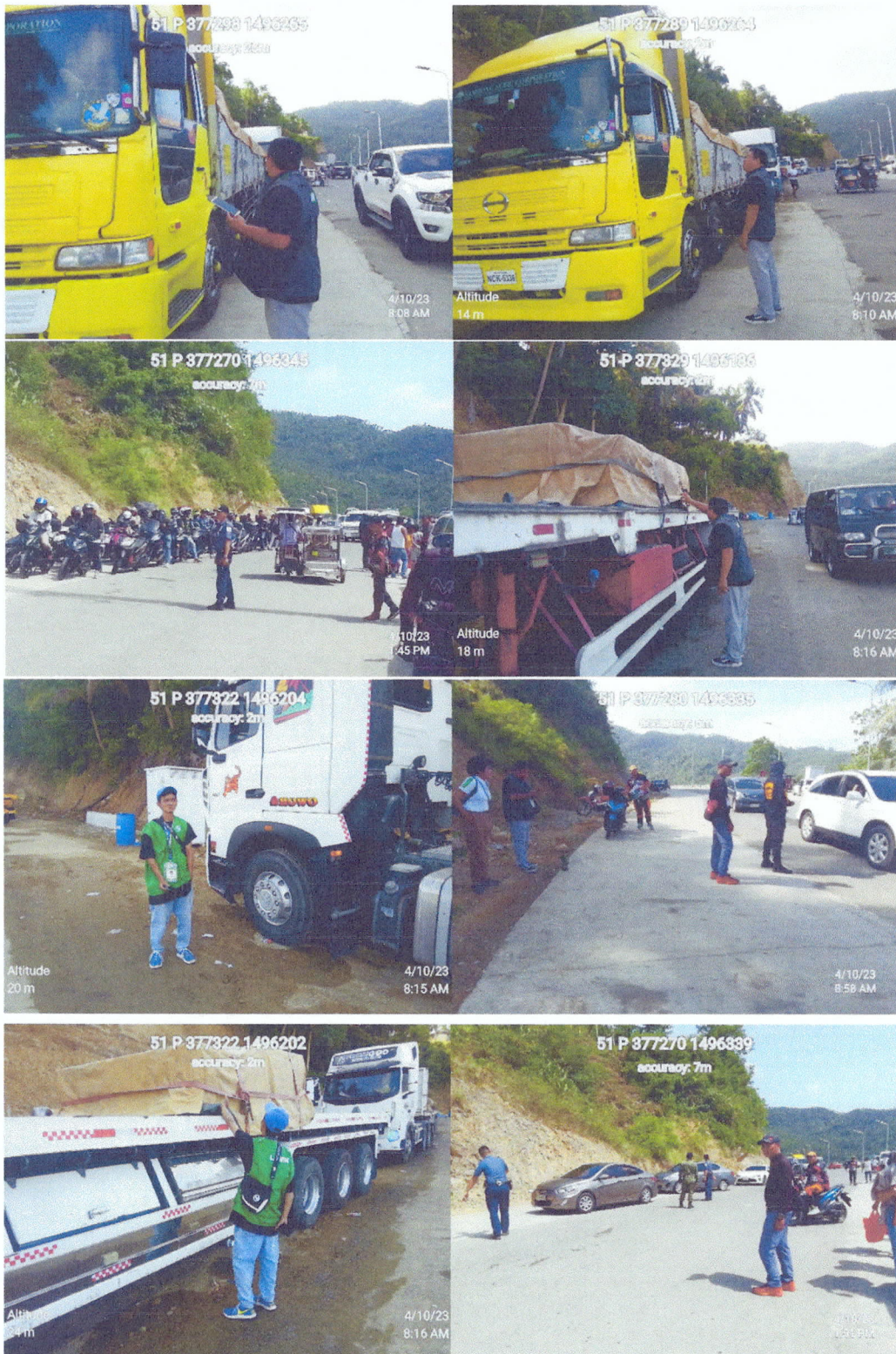
Monitoring of Balanacan Port – April 10, 2023