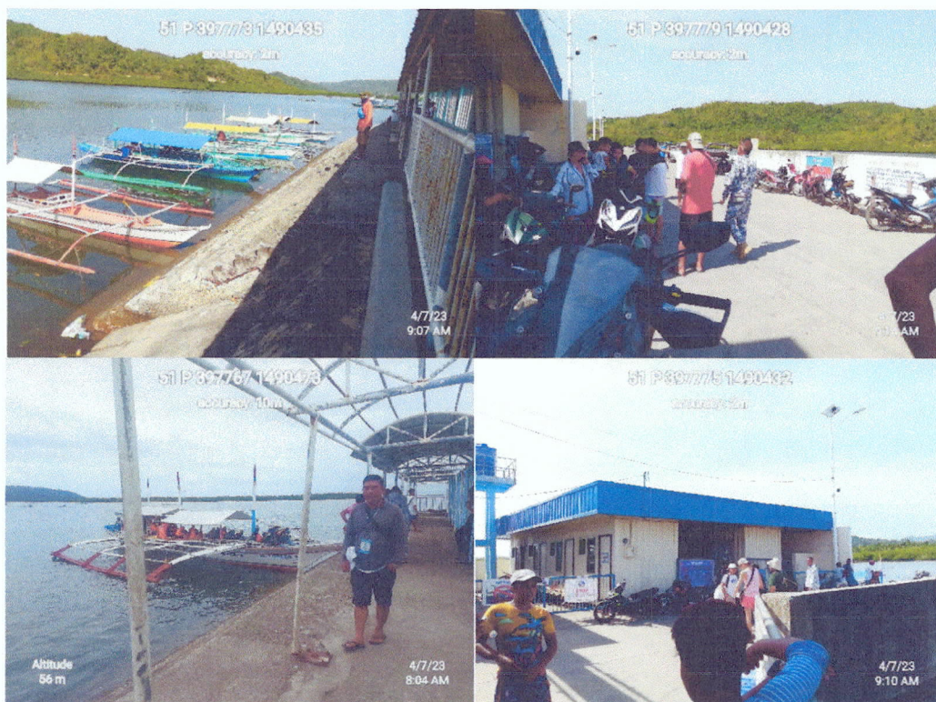
Monitoring of tourist going to Maniwaya and Mongpong Island – April 07, 2023