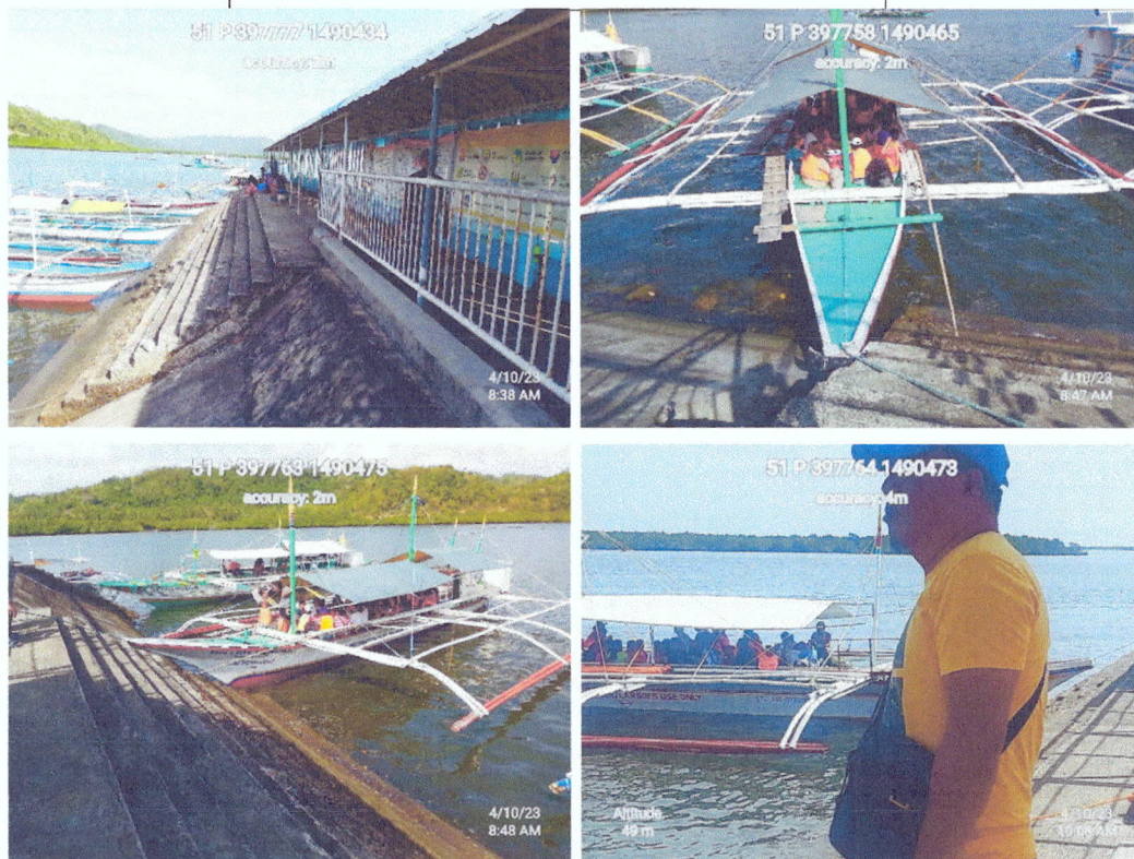
Monitoring of Buyabod Port – April 10, 2023