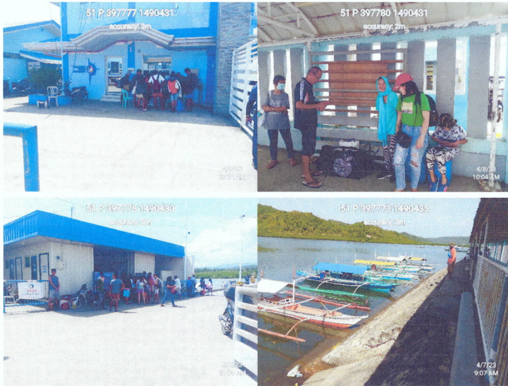
Monitoring of Buyabod Port – April 08, 2023