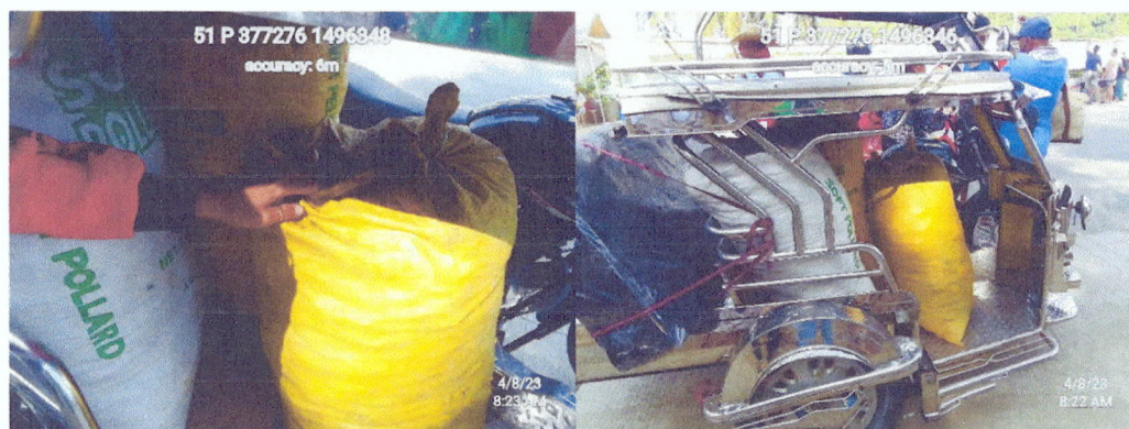
Alleged illegal transport of charcoal, however on verification it was coconut shell charcoal thus it was permitted to be transported