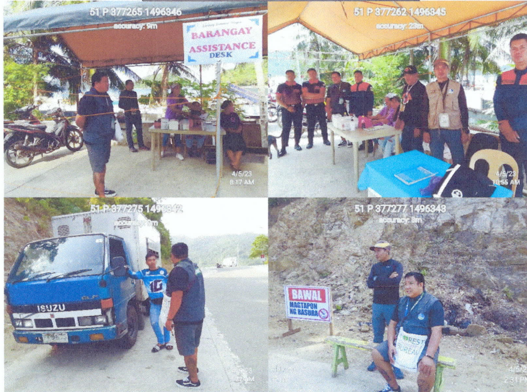
Monitoring in Balanacan Port – April 05, 2023