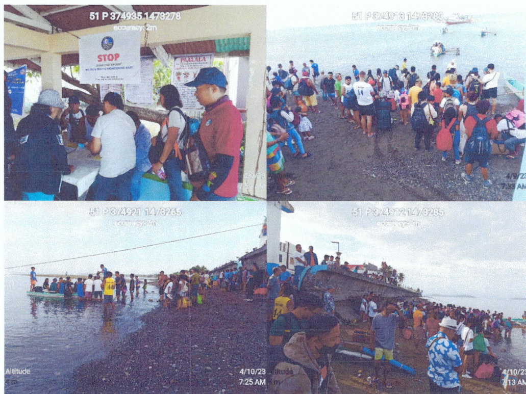
Monitoring of Gasan Port – April 09 to 10, 2023