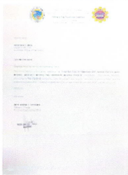
PGP PEO - PENRO.jpg 196K